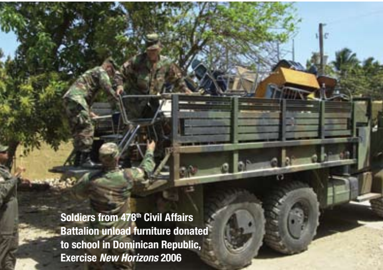
Soldiers from 478 th Civil Affairs Battalion unload furniture donated to school in Dominican Republic, Exercise New Horizons 2006