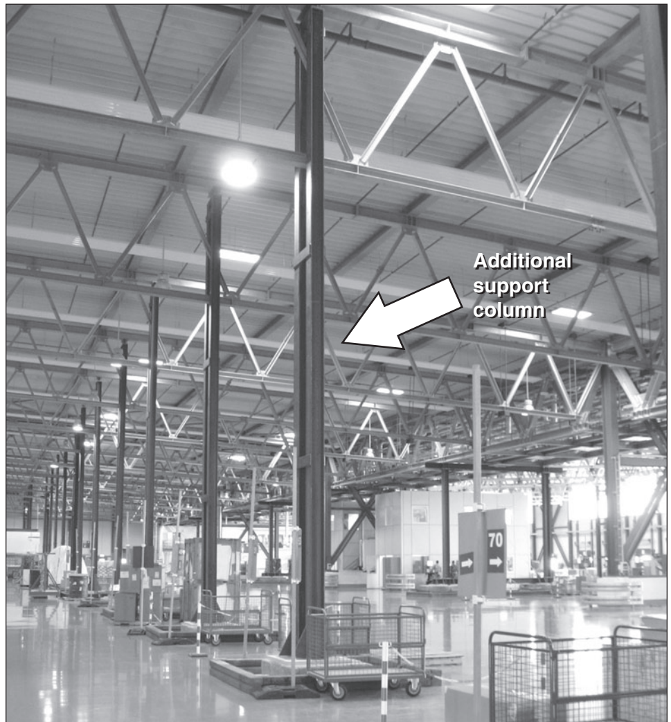
Figure 6: Example of Additional Support Column Installed in the Freight Terminal