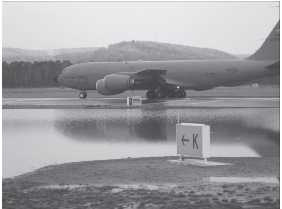
Figure 5: Example of Large Pond Next to Ramstein's South Runway