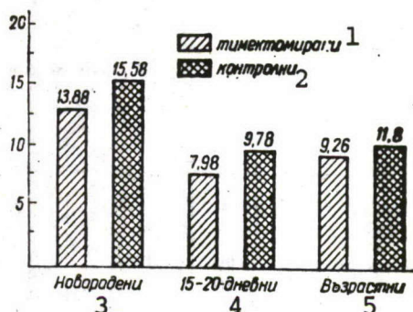
Figure 1. Key: 1) thymectomized, 2) control, 3) new-born, 4) 15-20 days old, 5) full grown.

a shock. This fact indicates that an early thymectomy does not permit the development of anaphylactic reaction in one group of porpoises. Each 15-20 day old porpoise developed a shock and died 3-4 minutes after the prescribed shot was administered. In the group of full-grown porpoises, 4 out of 13, which were thymectomized, did not develop anaphylactic shock (30.7%), and 2 out from the control group also did not develop the shock (28.5%). Juxtaposed data indicate that a difference is found in the marginal statistical error. The lack of anaphylactic reaction in one group of porpoises is difficult to connect with the increase thymus involution.