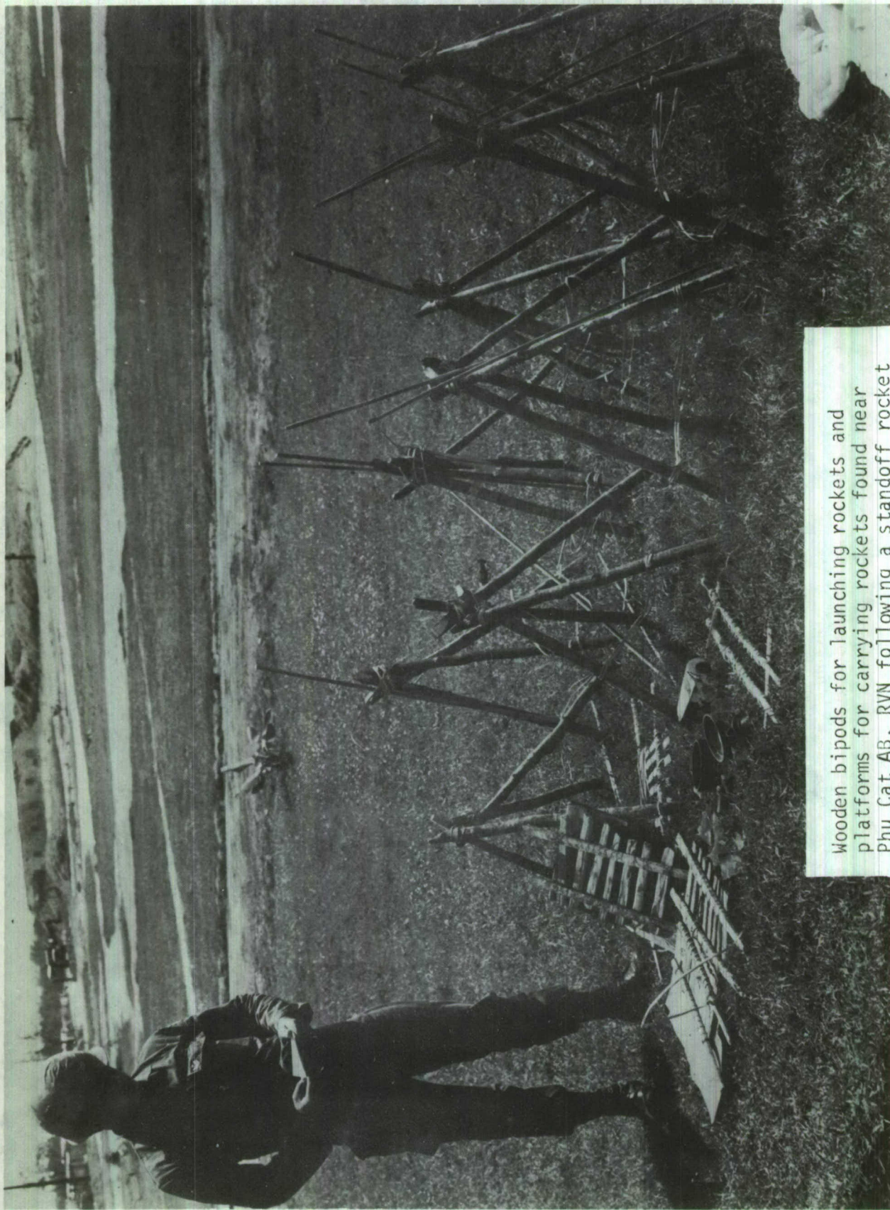
Wooden bipods for launching rockets and platforms for carrying rockets found near Phu Cat AB, RVN following a standoff rocket attack on 2 February 1970.