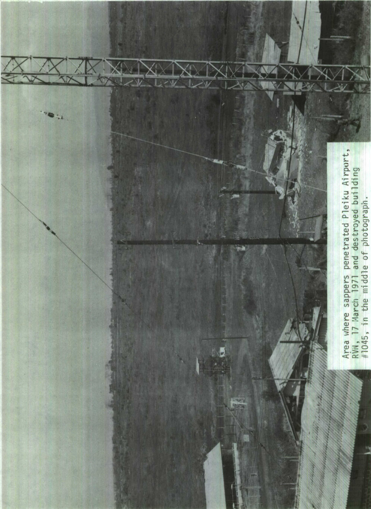
Area where sappers penetrated Pleiku Airport, RVN, 17 March 1971 and destroyed building #1045, in the middle of photograph.