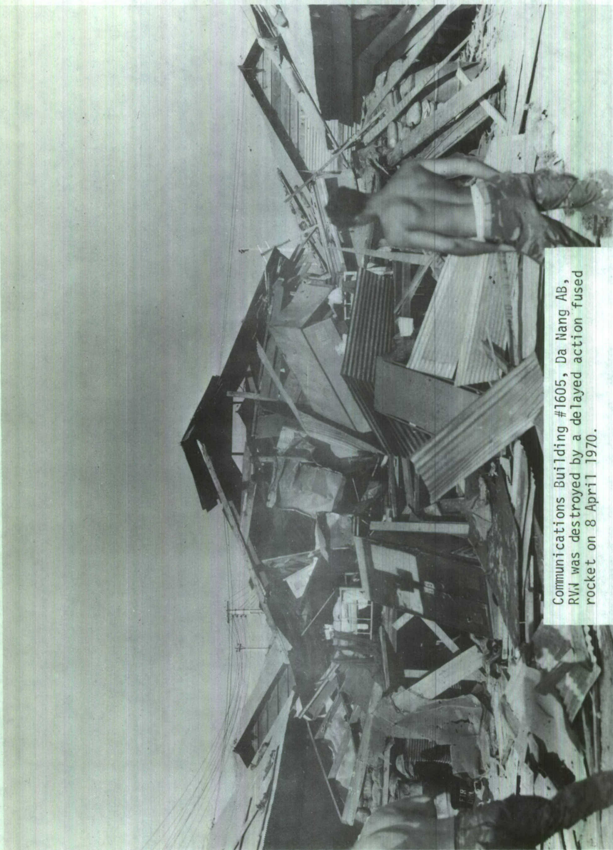
Communications Building #1605, Da Nang AB, RVN was destroyed by a delayed action fused rocket on 8 April 1970.