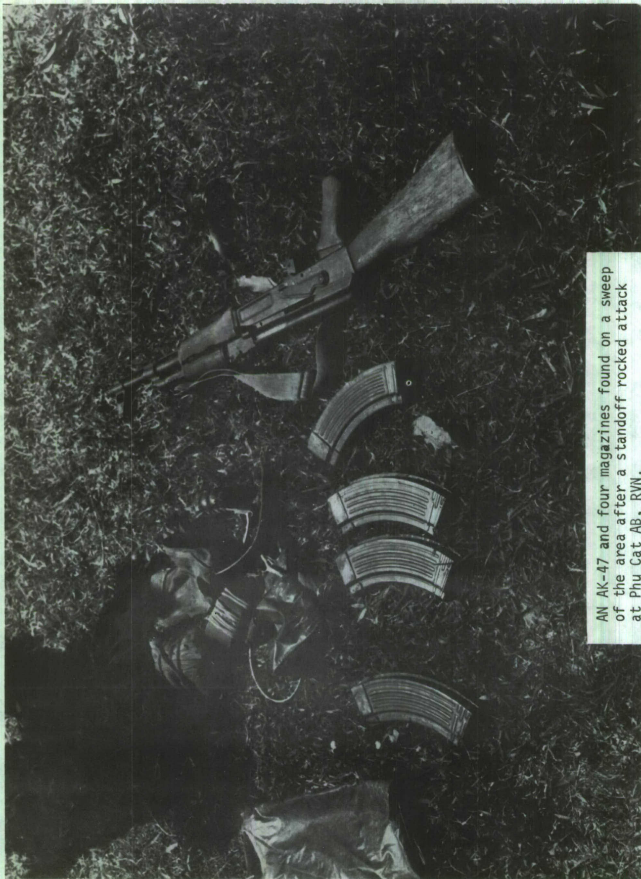
AN AK-47 and four magazines found on a sweep of the area after a standoff rocked attack at Phu Cat AB, RVN.