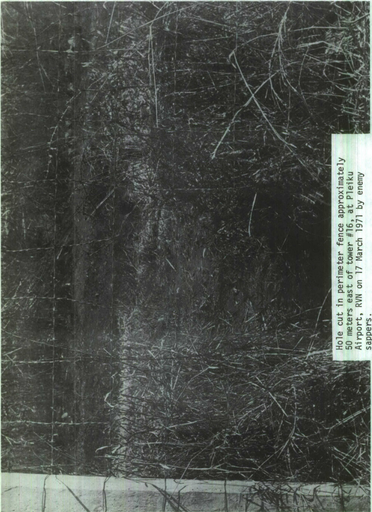
Hole cut in perimeter fence approximately 50 meters east of tower #16, at Pleiku Airport, RVN on 17 March 1971 by enemy sappers.