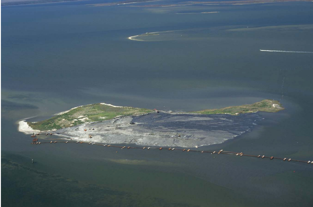
Figure 2. Control-of-effluent method used in North Carolina to restore tern nesting habitat and maintain grassy habitat used by nesting pelicans.

Slope. A dredged material island is rarely a perfect, inverted cone-shaped feature. Most often it consists of a lower drift ridge and swale, an upper drift ridge and swale, a steeper slope leading to the dome, and the dome itself (Figure 3, Soots and Parnell 1975b). Soots and Parnell (1975b) defined slope as the rise in elevation from the upper swale to the dome. A gentle slope of 30:1 (a rise of 1 m over a linear distance of 30 m) has been recommended for ground-nesting waterbirds (Landin 1986; Chaney et al. 1978).