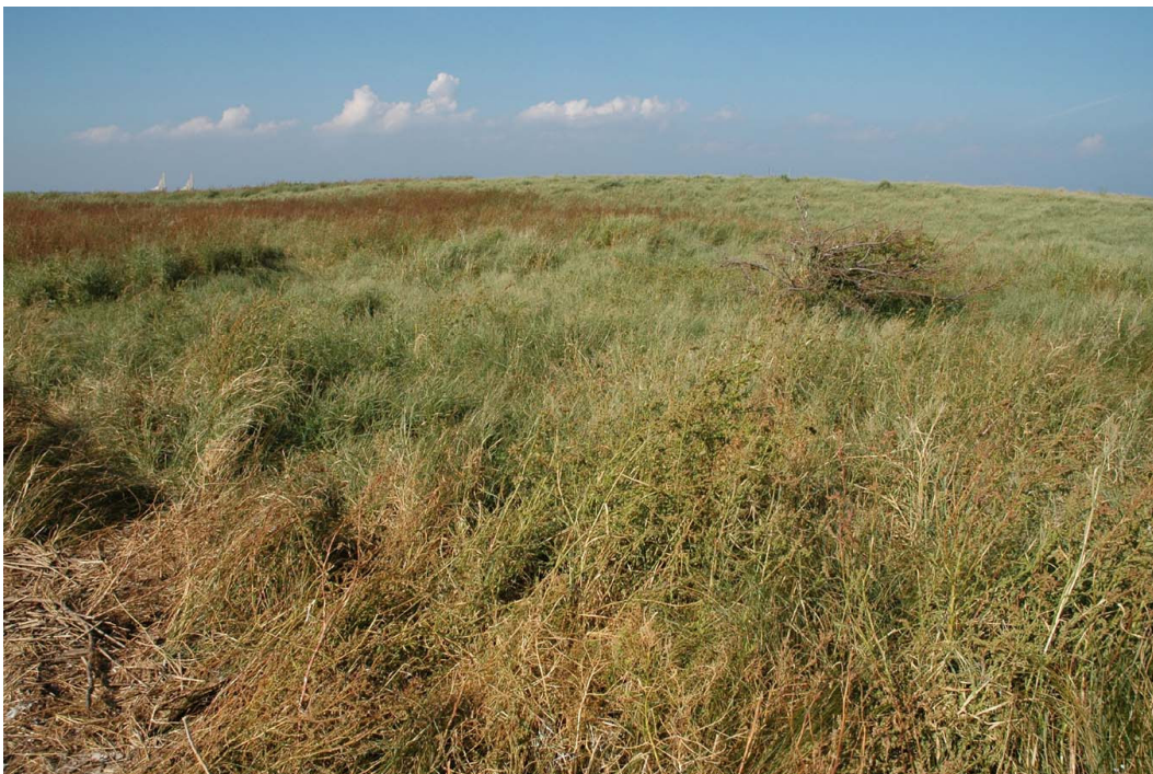
Figure 5. An undiked dredged material island less than 1 year after deposition of sand (top) and an undiked dredged material island approximately 12 years after deposition of sand (bottom).