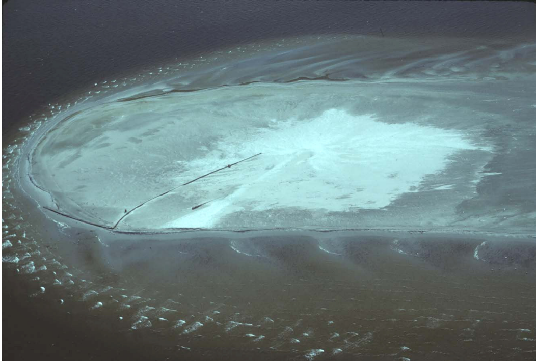
Figure 1. An undiked dredged material island with a single dome and a fresh deposit of dredged material.