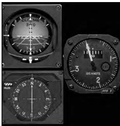
Figure 3 a and b: CT1 Pilot Display