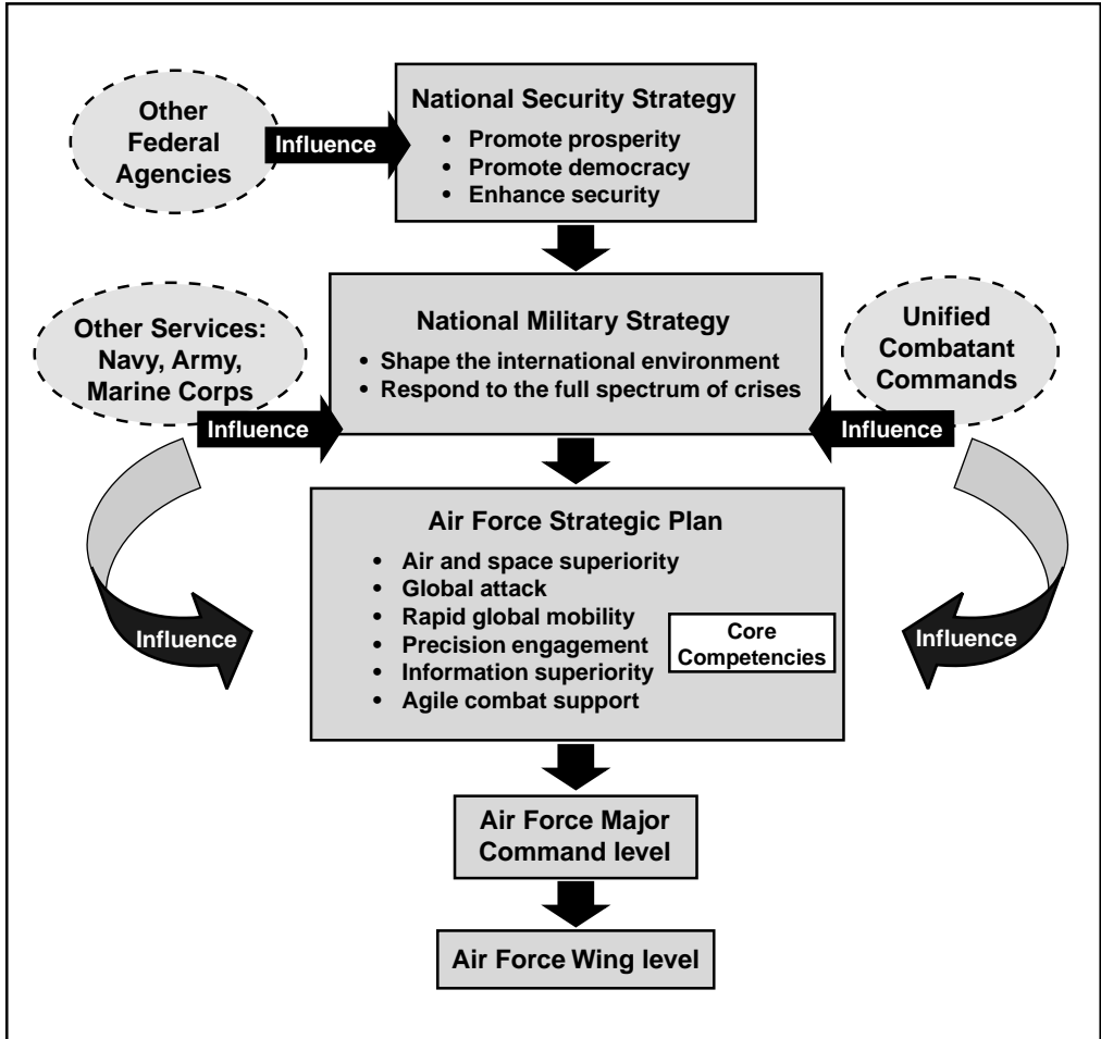
Figure 1. National Security Strategy Flow

ing the presence the United States will have on global affairs.