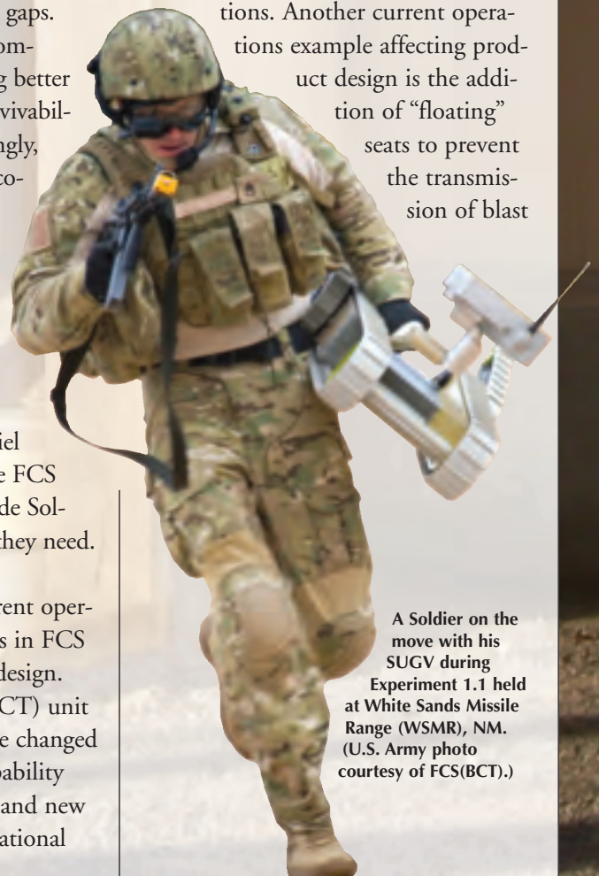
A Soldier on the move with his SUGV during Experiment 1.1 held at White Sands Missile Range (WSMR), NM.

Through a continuing, disciplined assessment process, materiel requirements are also adapting. For example, examining improvised explosive device threats led to upgrading armor for manned vehicles to prevent penetrations. Another current operations example affecting product design is the addition of "floating" seats to prevent the transmission of blast