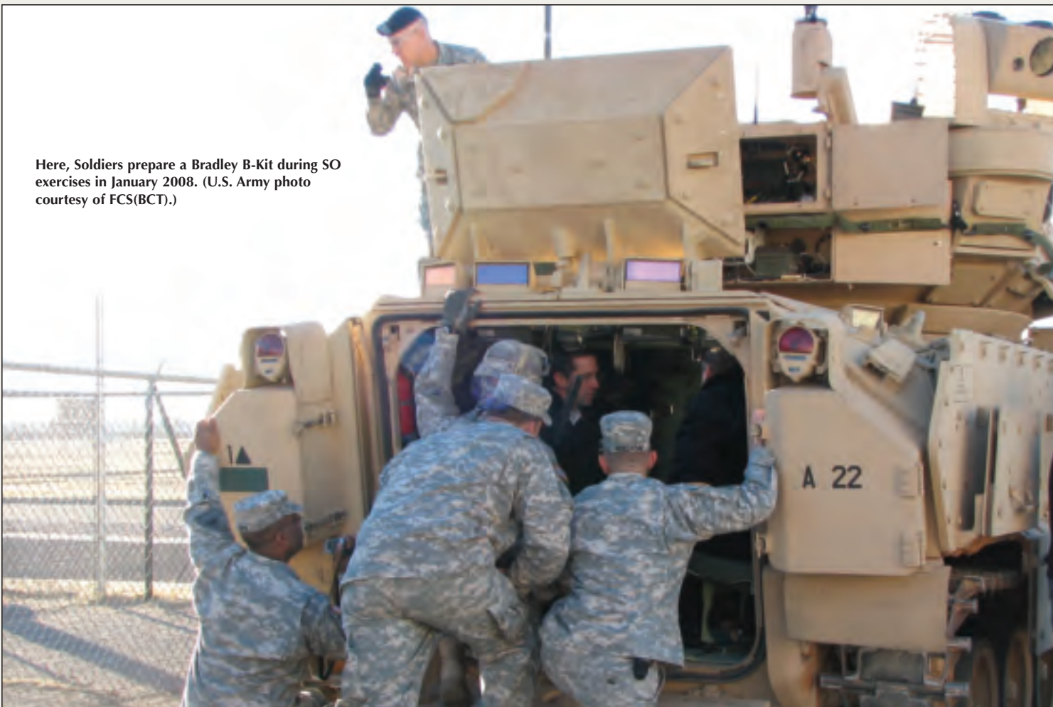
Here, Soldiers prepare a Bradley B-Kit during SO exercises in January 2008.

energy through the vehicle hull to a Soldier's body. Development of parallel capabilities helps to ensure that revisions are keeping pace through almost annual updates. Although change is always difficult in terms of costs and schedule, the FCS program has made great strides to meet the challenges of a changing operational environment.