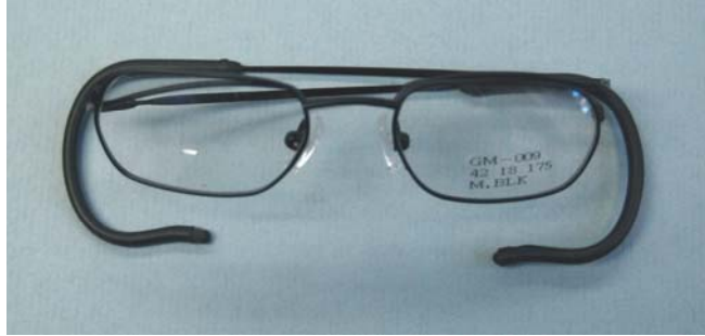
Figure 2. Wire frame eyewear manufactured by Rochester Optical.