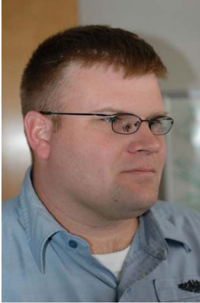
Figure 4. Submariner wearing wire-framed eyeglasses by Rochester Optical.

The test eyewear provided by Vision Xperts met the RFI requirements in terms of maintaining a tight seal, yet they were found to be generally unacceptable by the testers. Since the items were inserts meant to be worn inside of the face mask and not stand alone eyeglasses, participants reported they thought it would be unlikely that submariners would have these inserts on their person when they needed to don an EAB mask in an emergency situation. Overall, participants reported they felt these alternatives were not an improvement compared to the standard issue submariner glasses.