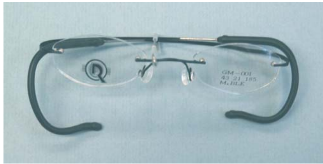
Figure 3. Three-piece mount frame manufactured by Rochester Optical.