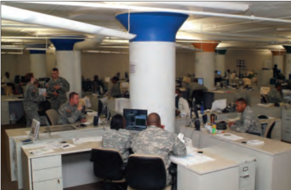
From ASC's DMC at Rock Island, Soldiers, Army civilians, and contractors synchronize logistics requirements of the ARFORGEN process. By matching global capacity and capability to logistics readiness requirements, the DMC ensures distributed and efficient workloading and delivery schedules.

management tasks — the same as it would in theater. To support the SBDE effort, the DMC has partnered with FORSCOM G-4 to facilitate a left-seat/right-seat transition of designated materiel management tasks to the SBDE after it returns from deployment. The DMC/DMT will assume those same materiel management tasks back from the SBDE prior to its next deployment, thereby ensuring continuity of effort and uninterrupted support to the customer base. The transition of tasks to and from the DMC team and the SBDE are based upon the SBDE's ability to perform the tasks, as determined by the unit's commander. The goal is to meet mission and training proficiency needs of the SBDE in garrison, while maintaining ASC DMC responsibility for CONUS-based materiel management.