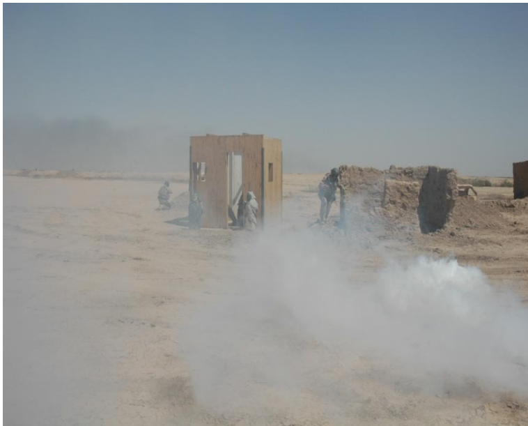
Figure 6—Shows a live fire exercise on a mobile range, involving simulated improvised explosive devices, rocket-propelled grenades, small arms fire, and foot movement while under fire.

Figures 6, 7, and 8 are photographs taken during a training exercise at Camp Butler Multi-Range Complex. The camp was an Iraqi army training area where a Republican Guard Brigade was destroyed in 2003.