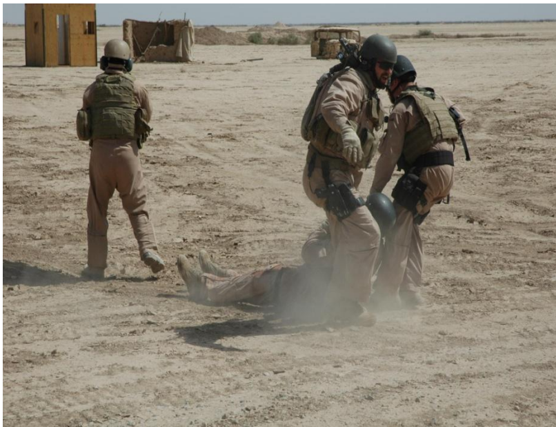
Figure 8—Shows the simulation of casualties to put teams under further pressure and test the team medics.