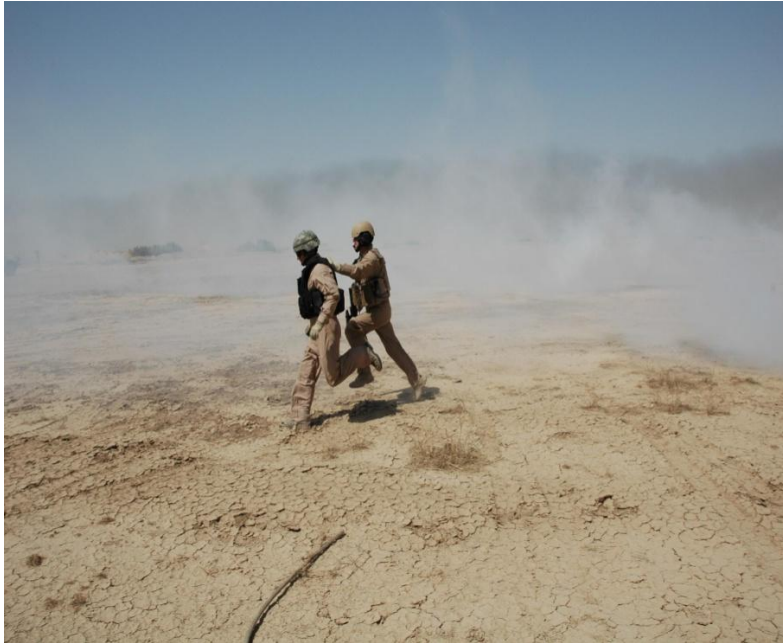
Figure 7—Shows Aegis personnel keeping the client safe and removing him from danger while under fire.