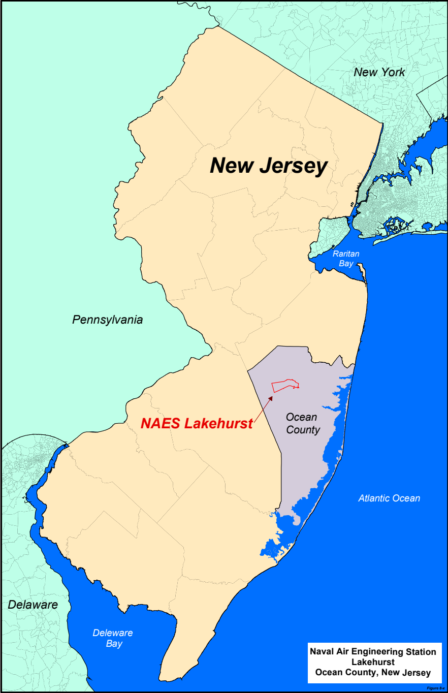
Naval Air Engineering Station Lakehurst Ocean County, New Jersey