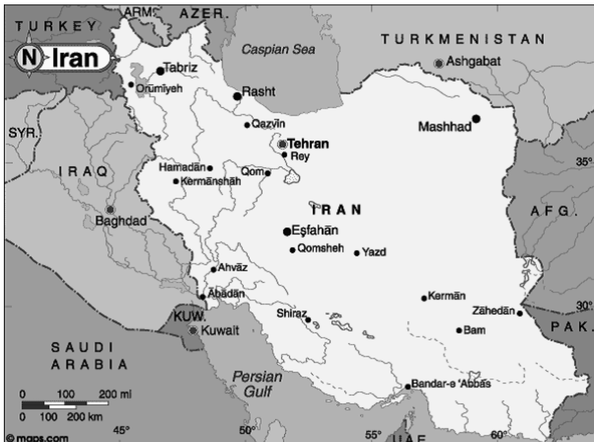
Figure 1 – Map of Iran 8

Iran's location is one element that defines its strategic importance to the United States. Iran, a nation slightly larger than Alaska 4 , lies at the crossroads of Central Asia, the Middle East, and South Asia, and has an extended border along the Persian Gulf (See Figure 1). The country has a strong national identity and deep historic cultural and economic ties and influence across the region. 5 Iran has a well-educated male and female population of over 65.8 million people. 6 Iran is one of the founding members of the Organization of Petroleum Exporting Countries (OPEC), and has the third-largest proven oil reserves and the second-largest natural gas reserves in the world. 7