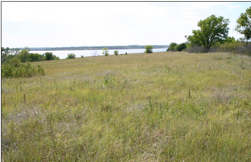
Figure 1. Native prairie managed at Tuttle Creek Lake, Kansas.

BACKGROUND AND PURPOSE: Approximately 800,000 acres of grasslands have been documented to occur on Corps of Engineers operational projects nationwide (Martin and Peloquin 2005). Results of a recent Corps of Engineers Workshop (U.S. Army Corps of Engineers (USACE) 2006) revealed that many natural resource managers are actively involved in prairie restoration and management (Figure 1), and there is considerable potential to improve prairie communities and associated water resources on project lands throughout the United States. Prairie lands are important for proper watershed-wide management, serving as buffers to adjacent waterways that improve water quality and control water quantity. The conservation and management of these grasslands are critical to terrestrial and aquatic ecosystem quality (The Nature Conservancy 2000). Native prairies function as stable plant communities supporting wildlife, and qualify as meeting the Corps criteria of the “Sustainable Lands Performance Measure,” now tracked by the Operations and Maintenance Business Information Link (OMBIL) and incorporated in the Environmental Stewardship Budget Evaluation System (ESBEST). Managing prairie lands offers a sustainable watershed-wide approach that is not only important to Corps reservoirs, but also to waterways nationwide.