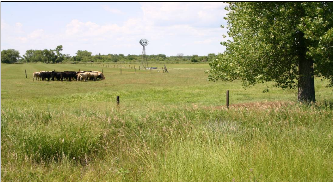
Figure 6. The size of the herd of cattle grazing is calculated so as not to exceed the carrying capacity of the land, dependent on acreage and type of ecosystem.

If the stocking rate of cattle exceeds the acreage necessary, damage to prairie ecosystems is a serious concern (Figure 6). Cattle can compact the soil to considerable depths, particularly when the soil is moist. Compacted soil absorbs precipitation poorly, plants get less water, and there is more runoff leading to erosion. Compaction of the soil, removal of vegetation, and cattle trails that form a conduit for serious erosion are all negative consequences that impact a natural prairie system and impair its abilities to store water. When the soil becomes compacted, soil porosity is lost, plant growth rates slow down or cease, and less water is taken up by plants or stored in the soil, increasing soil runoff. Aeration is essential for maximum water absorption because a good oxygen supply is required for the maintenance of the respiration activity and permeability of plant roots (Taylor 1972). The amount of aeration required also depends upon the amount of work that a root must do in expanding against the forces of the soil; as the amount of energy that must be exerted increases, the amount of oxygen necessary for a given growth rate also increases (Taylor 1972).