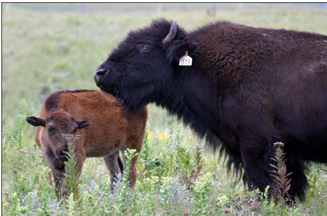
Figure 5. Buffalo at the Konza Prairie Research Station.

Controlled Grazing. Grazing studies are being done at the Konza Prairie Biological Station in Manhattan, Kansas (Figure 5). The studies involve a herd of approximately 300 buffalo, grazing on 2,500 acres of prairie within a well-fenced area, and research has indicated that grazing benefits the herbaceous and woody components of prairies with proper stocking rates. Stocking rates are critical to preventing removal of prairie grasses, such as Side-oats Grama ( Bouteloua curtipendula ), Big Bluestem ( Andropogon gerardii ), Little Bluestem ( Schizachyrium scoparium ), Indiangrass ( Sorghastrum nutans ), and subsequent replacement of lesser quality grasses. If the carrying capacity of the land is not exceeded, grazing generally results in an increase in the root/shoot ratios, particularly on the cooler grasslands (Sims et al. 1978).