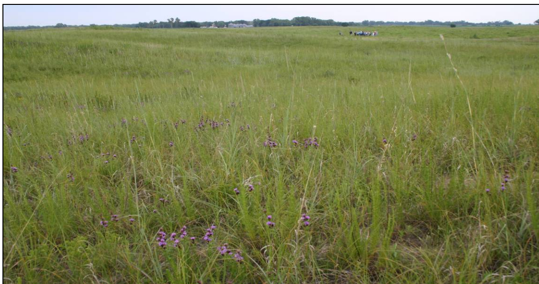
Figure 2. Grasses and forbs have evolved together in a Sandhills Prairie owned by the Nature Conservancy in Nebraska.

THE ROLE OF PRAIRIE GRASSES AND FORBS: Vascular plants, particularly grasses, are the most important organisms in the prairie system and provide most of the biomass. Since their weight above ground is exceeded by the amount of roots underground, vascular plants can contribute 2 tons/acre of live organic matter (biomass), and may easily exceed that given climatic conditions (Nagel and Plambeck 1998). Most prairie plants are perennial, storing the carbohydrates produced during the growing season in their roots. The grasses and herbaceous plant community have adapted to capture nutrients efficiently by growing in different seasons (Figure 2). Adaptation of prairie plants that also reduces competition occurs in the C3 and C4 photosynthetic pathways. The cool season C3 grasses are active in the spring and fall, and in shaded areas. The warm season C4 grasses are active in the summer and in full sunlight. Many exotic plant species exhibit the C3 pathway; this enables them to compete and survive with the C4 grasses (Nagel and Plambeck 1998).