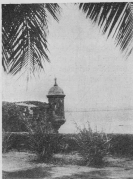
FIG. 2. ONE OF THE MANY BEAUTIFUL SENTRY POINTS ALONG THE WALLS.

The entire city island of San Juan was surrounded by walls of masonry, twenty or more feet thick, with a continual series of embrasures for guns and beautifully formed, circular, domed sentry boxes jutting out from the