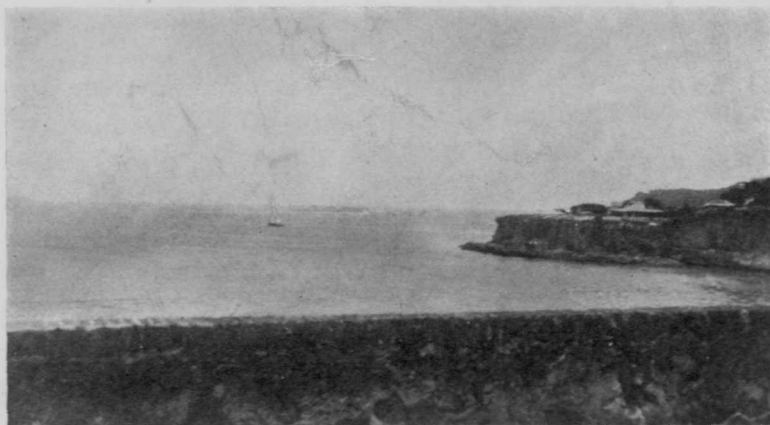
FIG. 3. SOME MORE OF THE WALLS, WITH THE LITTLE ISLE OF CANUELO IN THE MIDDLE BACKGROUND.

These additional fortifications were built during a long period of peace for Porto Rico, lasting from the Dutch siege of 1625 to the third British attempt in 1797. The British landed again, after the manner of the Earl of Cumberland, not on the island of San Juan, but on the adjacent mainland, in what is now the modern suburb of Santurce. They planted their guns on the site of what is now the present luxurious Hotel Condado-