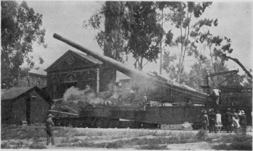
FIG. 3. DEMONSTRATION OF THE GUN AT BENICIA ARSENAL AT ITS STORAGE POSITION.

The appearance of the gun in the Middle West attracted large crowds of interested citizens all along the route and many mentioned the trip of the first gun of this type in 1925. Arrival at one Iowa town found the fire