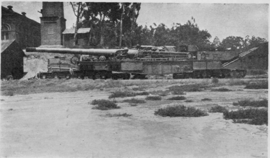
FIG. 2. BENICIA ARSENAL—GUN IN TRAVELING POSITION. Taken on day of completion of movement.

Progress of the movement was kept in the form of a log book, in which was recorded principally the duration of all runs and stops. In the compilation given hereafter the stations shown coincide generally with railroad division points, or include portions of trackage where the topography or trackage features have bearing on the speed or performance of the mount. The only other record kept was a detailed diary which proved useful in the preparation of the report on the movement.