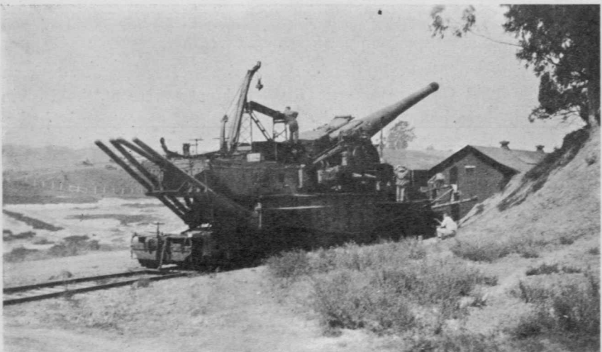
FIG. 1. PREPARING GUN FOR DEMONSTRATION AT BENICIA ARSENAL.

The letter of instructions to the officer in charge of the movement