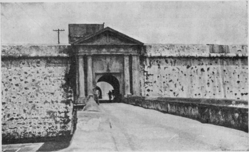
FIG. 1. A GATEWAY OF THE CENTURIES.

A mechanized force, such as the one suggested, would find mobility conditions rather good in Porto Rico, despite the hectic mountainous character of the country in the interior. There are very good macadam or other hard surfaced roads connecting all parts of the Island, which is some one hundred miles long and forty wide, containing three thousand square miles of territory. Level, firm ground suitable for aircraft base and A. A. positions may be found along the coastal strips and in several spots in the interior