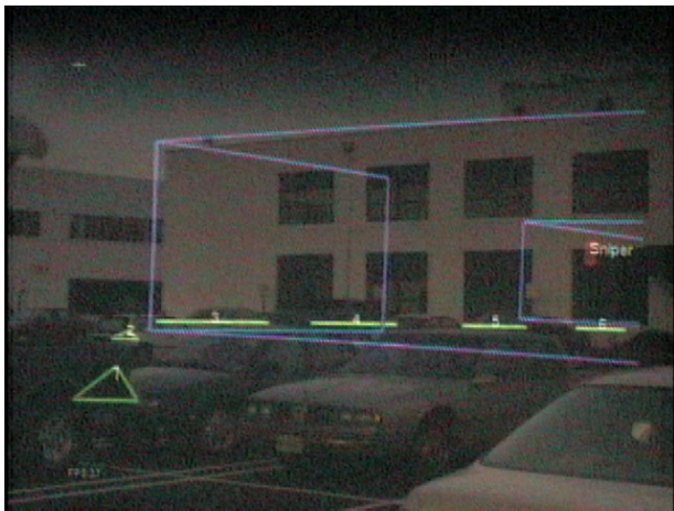
Figure 2: Sample output from the prototype augmented reality system. In this scenario, a user follows a route (triangles) around the edge of a building. Sniper is visible beyond.