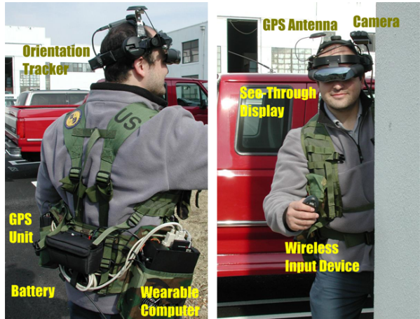
Figure 1: Prototype mobile augmented reality system. This system is constructed from COTS products.

The display in Figure 2 appears to be relatively straightforward. However, if the display becomes much more complicated, significant improvements in systems technology will be required. We focus on two such issues — display management through information filtering and intuitive 3D user interaction paradigms.