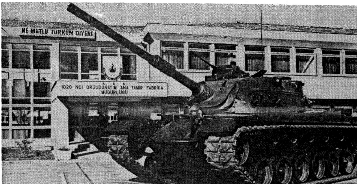
Turkish Land Forces are upgrading their older tanks to the M48A5T1 at the Kauseri Tank Production Plant.

evening, he put together the briefing slides and briefing materials he was going to need. Upon arrival, he finds that most of the TLFC general officers are assembled for what he had believed would be a small, informal briefing. His briefing will help the Turks make key decisions regarding the weapons systems they will commit themselves to in the future.