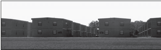
Barracks for about 600 soldiers at Fort Drum, New York.