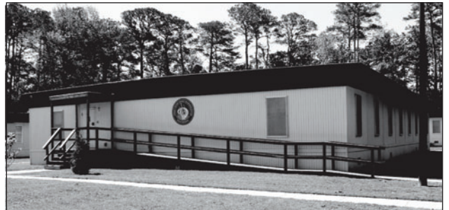
Administrative space for about 60 people at Naval Amphibious Base Little Creek, Virginia.