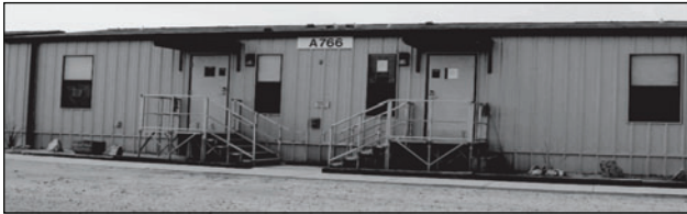
Barracks at Fort Bliss, Texas.