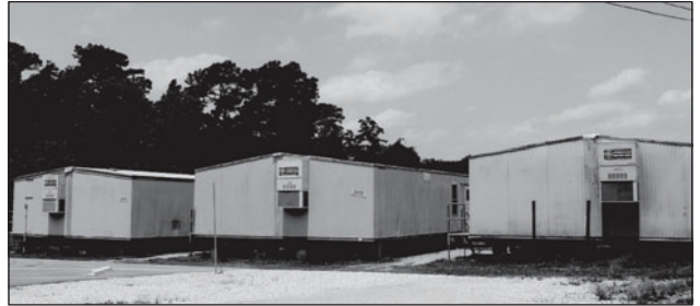
Administrative space at Camp Lejeune, North Carolina.