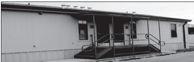
Barracks at Fort Hood, Texas.