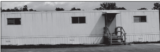
Training management space at Eglin Air Force Base, Florida.