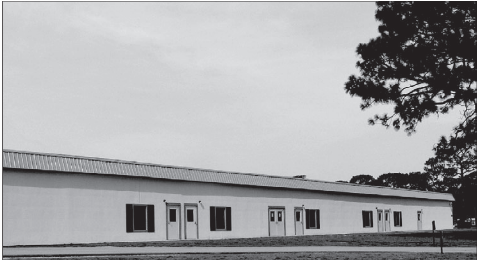
Figure 4: A Relocatable Facility Consisting of 33 Trailers at Eglin Air Force Base, Florida