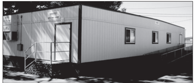
Counseling center at Camp Pendleton, California.