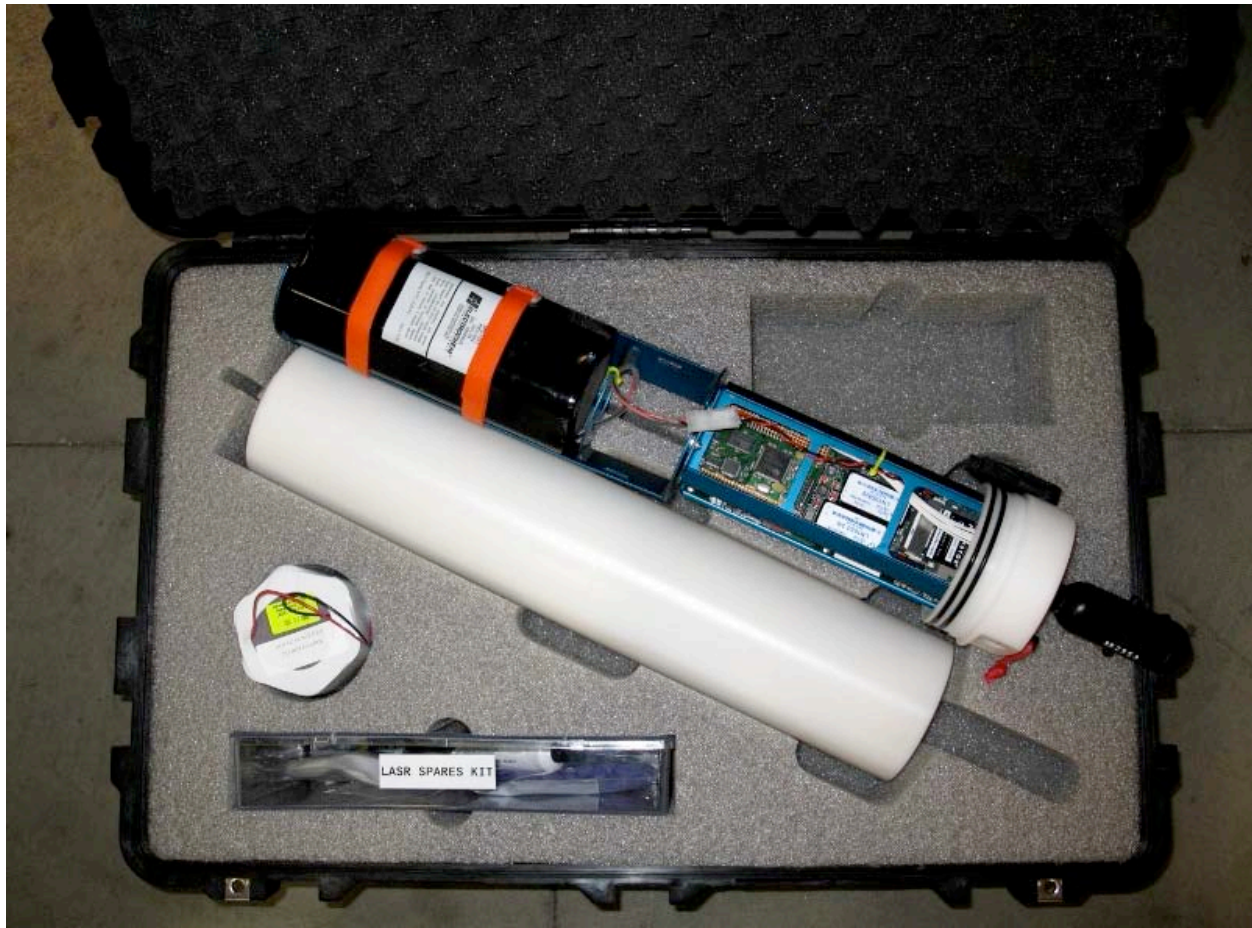
Figure 2. Self-recording ambient sound system. The A-size sonobuoy form factor can operate unattended for 30 days using primary lithium batteries.

The ambient noise recording module consists of a broadband hydrophone (100 kHz bandwidth), a signal conditioning board, a high speed a/d board capable of sampling up to 190 kHz, and a DSP board for computing broadband acoustic spectra. All data sets are controlled and recorded by a Motorola 68332 based embedded microcontroller, with data written to compact flash. As a result of this grant, we have developed a self-recording version of the system that is 4 7/8" diameter x 30". When powered by primary lithium batteries, the system can operate continuously for 30 days. A pressure sensor is also integrated into the system so that the depth of the sensor can be tracked in time. We anticipate building a small array of sensors and conducting tests with the system through separate ONR funding.