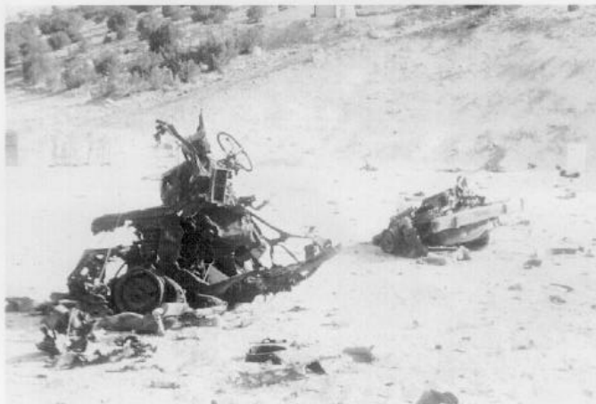
Fig.5 Target effects on a vehicle 4.5m from 454Kg of TNT