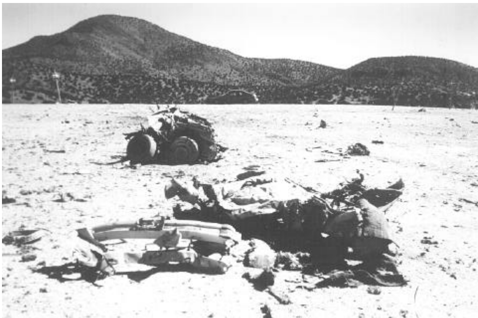
Fig.4 Target effects on a vehicle positioned 4.5m from 454 Kg of Mixture Y