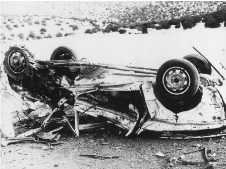
Fig.3 Target effects on a vehicle positioned 4.5m from 454Kg of Mixture X