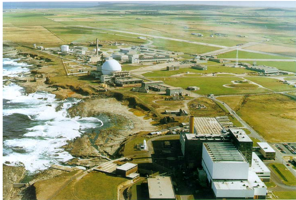
An aerial view of the Dounreay site as it was in the late 1970s.