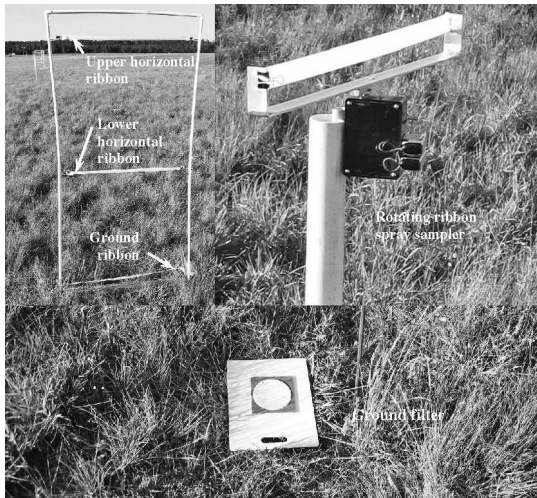
Fig. 1. Ultra-low-volume space spray samplers.

alternated, and the oil-based applications were made at the end. Five applications were made from 1900 h to 2300 h on April 21, 2008, and 4 were made between 0700 h and 0900 h on April 22, 2008. Sunrise and sunset on these dates were at 0650 and 2000 h, respectively.