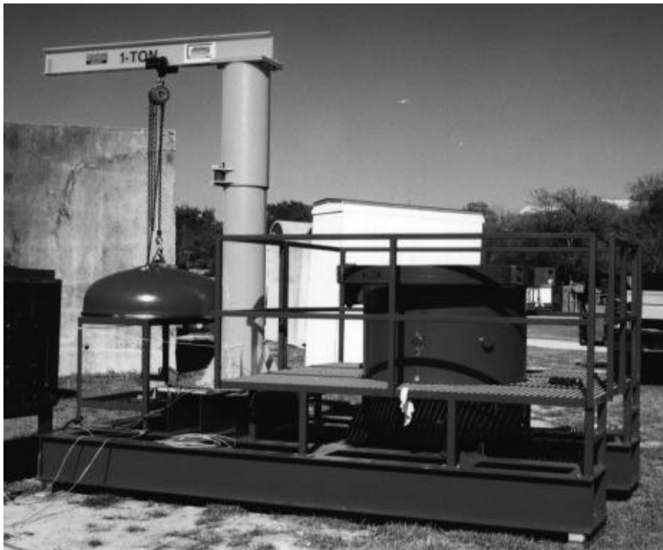
Figure 3. Fabricated Container and Frame