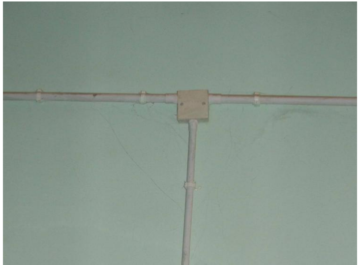
Site Photo 11. Building 6 interior wiring