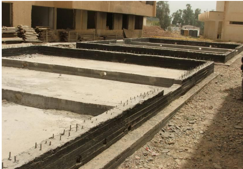
Site Photo 4. Latrine foundation and floor slab

At the time of the SIGIR site assessment, the contractor had constructed the foundation and the floor slab for the latrines (Site Photo 4).