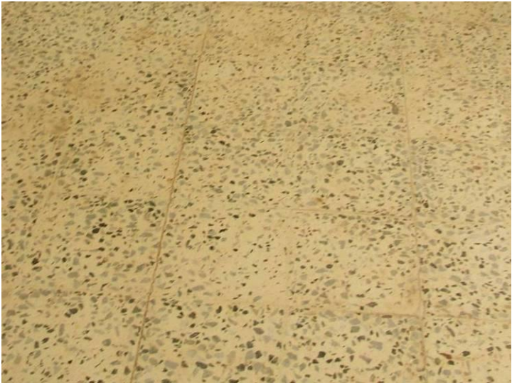
Site Photo 10. Tile flooring

As part of the renovation, the contractor replaced the tile floor. The floor was level with no apparent cracking or displacement (Site Photo 10). The contractor was in the process of installing new electrical wiring and conduit in the building. In accordance with the SOW, the contractor was surface mounting the conduit (Site Photo 11). The contractor was using junction boxes to join intersecting runs of conduit.