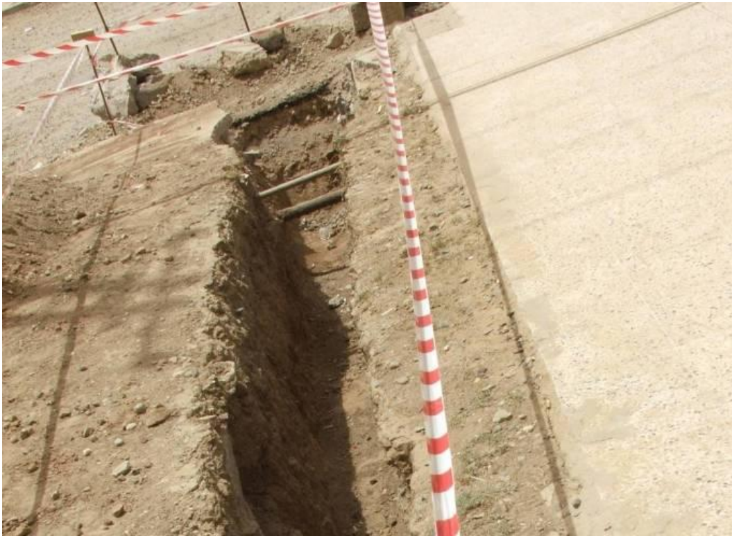
Site Photo 1. Excavation for underground utilities

At the time of the SIGIR site assessment, the contractor was performing general site work. Excavation for the underground utilities was performed and caution tape had been placed around the excavation (Site Photo 1).