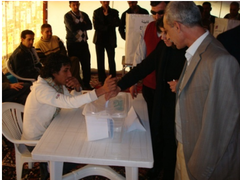
Figure 5—Civil Society Organizations Members at Training facilities in Erbil.