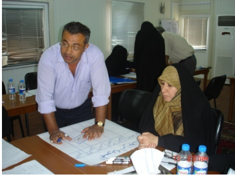
Figure 4—Political Party Members Select Issues for Provincial Council Campaign in Erbil.

Figures 4 and 5 display examples of NDI activities.