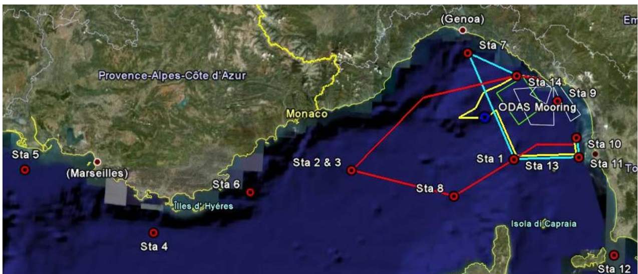
Figure 1. Tentative glider mission plans (19 Sep to 10 Oct 08) for three gliders based.