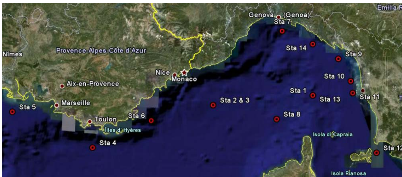
Figure 2. Station locations on a Google Earth projection.

Operational Schedule during the Cruise --- The Ligurian Sea Cal/Val Sea Trial (LSCV-08) is scheduled from 15-28 October 2008 on NURC's NRV Alliance , a 100m research vessel that holds up to 24 scientific personnel. This will be the largest international effort (USA, FRA, ITA, CAN, GBR, UKR and JAP) for calibration and validation of ocean color satellite data that has been planned to date. A tentative list of station position, date and general location is shown in Table 1 for this 14 day sea trial. These station positions can and will be changed as satellite ocean color data is received, so that those areas with the largest bio-optical gradient are extensively sampled. Both clear and coastal areas will be sampled to include two days around the Boussole mooring, south of Nice, and one day in the more eutrophic waters of the Gulf of Lyons (Figures 2 and 3; Stations 2-3 and 5, respectively).