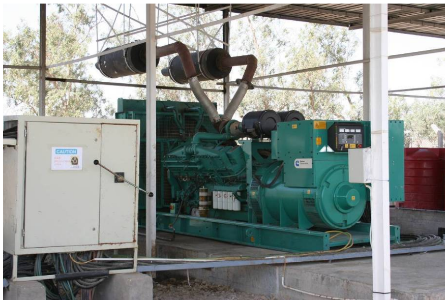
Site Photo 7. IP area 1.0 MW electric generator.

The assessment team found that two 2.2 MW diesel generators were initially installed to provide sufficient power for the IP buildings and dining facility. These generators were, however, relocated to another ECCI site and replaced with two 1.0 MW generators in late April 2005. One of the 1.0 MW IP generators is displayed in Site Photo 7. However, the contractor has since decided to add a third 1.0 MW generator to the power production system in order to ensure sufficient power capacity and increased emergency or standby capability.