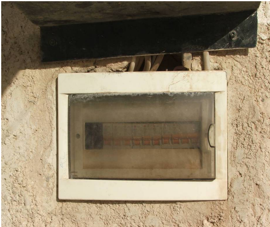
Site Photo 32. Weather exposed circuit breaker box.

During fieldwork, the assessment team verified that the contractor implemented a deficiency tracking system in February 2006 to detect, monitor, and correct construction deficiencies. In addition, the government's QA team implemented a system to monitor the status of the pending corrections. As such, this report will not include a finding or