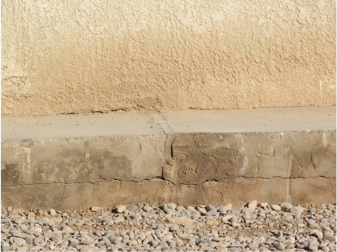
Site Photo 23. East barracks horizontal foundation fracture.

During the assessment, the team was told by the contractor's Project Manager that concrete placement was conducted using small batches mixed by hand. Small hand batch mixing and improper joining techniques could have contributed to the horizontal fractures due to lack of consistency between the numerous small batches mixed by hand. For practicality reasons, each small batch was not subjected to a slump test.