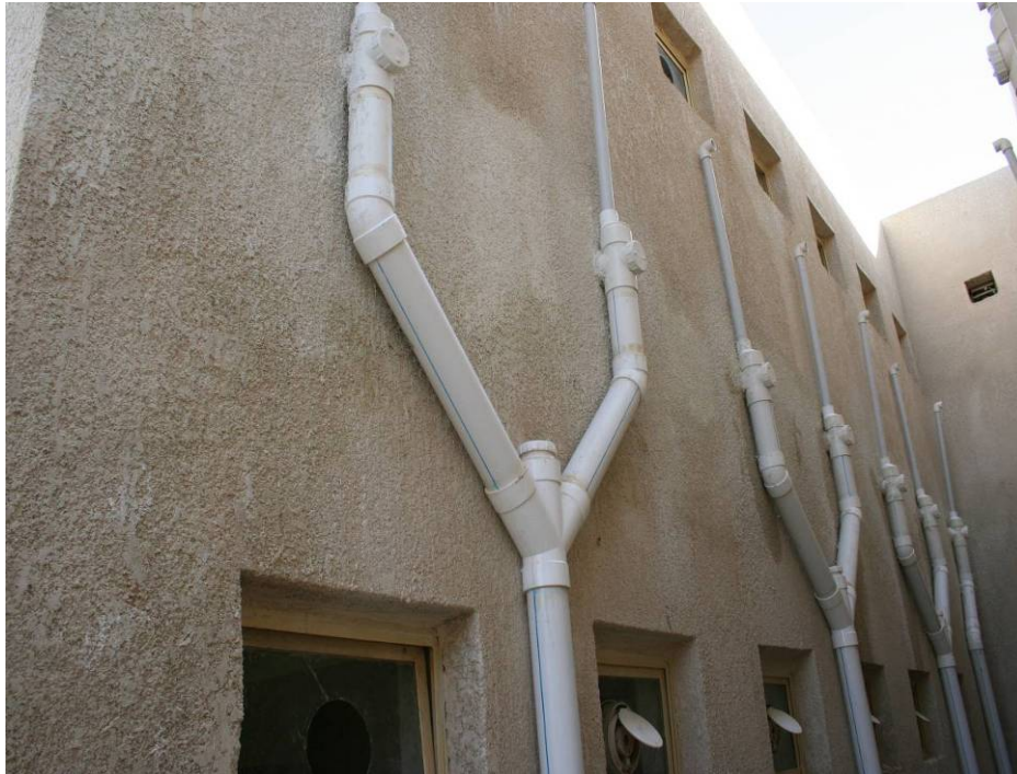
Site Photo 33. Reworked drain lines with upgraded material and improved “Y” design.

recommendation to implement an effective deficiency tracking system or improve related QM procedures. In addition, we verified that the contractor used better materials and an improved drain pipe design when correcting the aforementioned leaks in dormitories D1 and D4 (Site Photo 33).