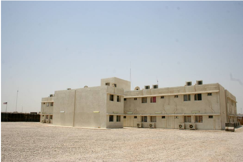
Site Photo 14. IP area instructor barracks.