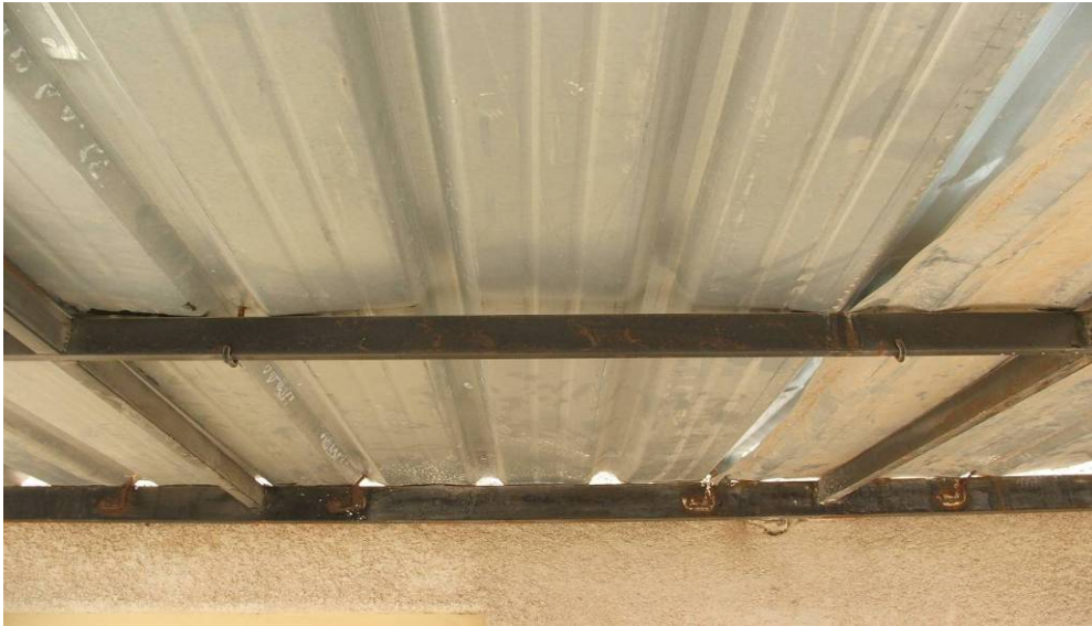
Site Photo 27. Tin fastened without sufficient number of fasteners.

Comparisons of acceptable and not acceptable workmanship for the same task demonstrate the impact of inadequate QM oversight. In the first comparison, the metal roof cover material (Site Photo 27) fastened with too few and improperly located hooks/fasteners to secure the roof cover was compared to properly fastened tin (Site Photo 28) where a fastener was located at tangent points between the tin and the angle iron frame. The second comparison shows water damage to a plywood door improperly hung too close to a wet floor area in a bathroom (Site Photo 29) compared to a door in an adjacent stall properly hung approximately 1” above the floor (Site Photo 30).