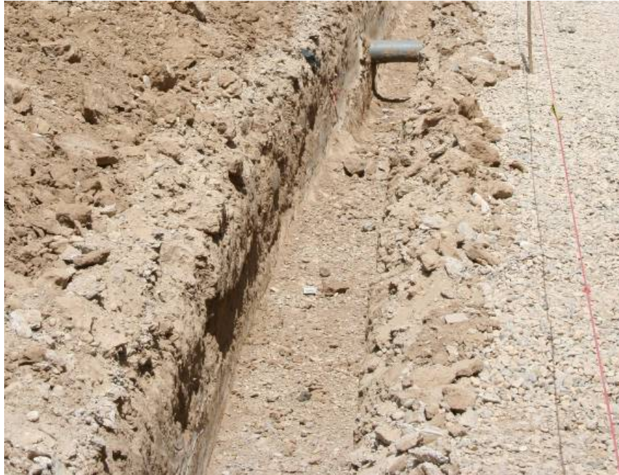
Site Photo 9. Machine polished trench sidewall soil.

Rather than utilizing a drain field system, the permeable septic tanks were designed to depend on pump trucks to remove excess effluent. However, the contractor's design did not meet requirement because it did not support academy needs in terms of daily volume. When coupled with insufficient soil drainage and limited pump truck capacity, substantial excess waste water overflowed from the septic system. Site Photo 10 shows waste water overflow standing on academy grounds.