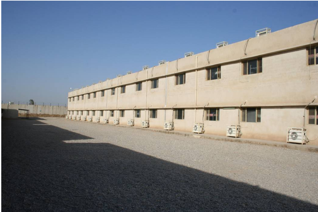
Site Photo 12. IP area cadet barracks.

At the time of the assessment, most of the new building construction, renovation, and road construction was complete. While some lingering rework issues in a cadet dormitory precluded 100% operational capability at full capacity, those issues were pending complete resolution at the time of our site visit. The assessment team observed selected aspects of new construction and renovation work. They performed inspections of the cadet and instructor's barracks, classrooms, IP headquarters building, DBE headquarters building, clinic, and gymnasium. Site Photos 12 to 17 show some of their observations.