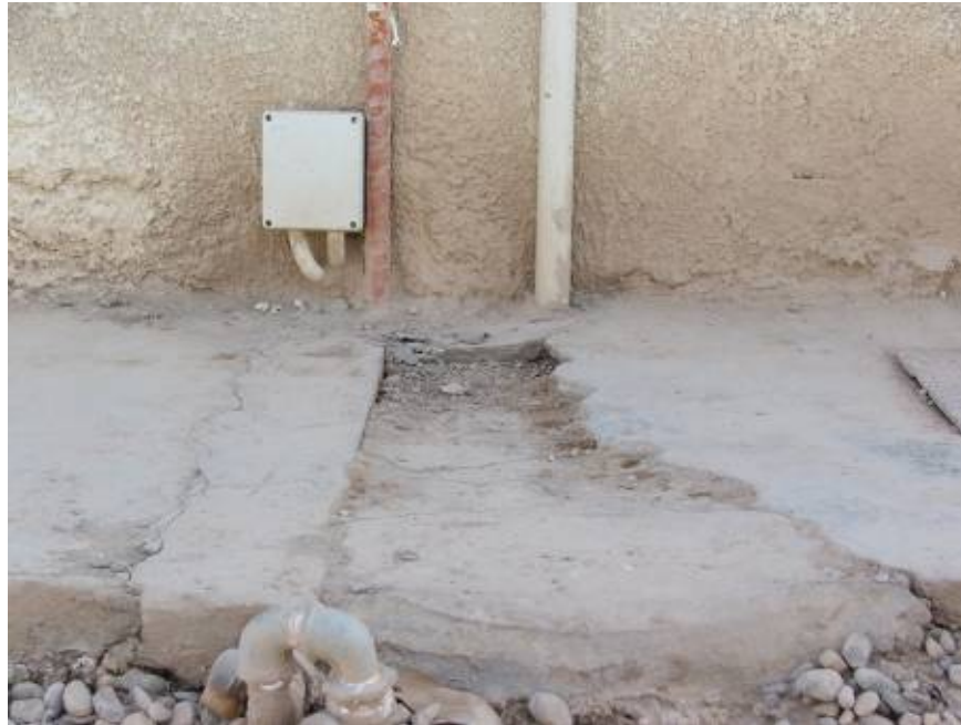
Site Photo 21. Uneven patchwork in Academy HQ sidewalk.

During the site visit, the team observed horizontal fractures that ran along almost the entire perimeter of the newly constructed middle and eastern barracks building foundations. Site Photos 22 and 23 show the described fractures. In addition, similar, but less obvious, horizontal fissures were observed on the second floors of the dormitories.