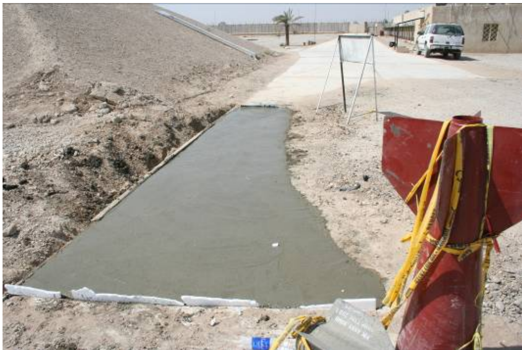
Site Photo 18. DBE area roadway.

While on site, the assessment team observed that a section of roadway was poured with no hydration until much later in the day. July afternoon temperatures at Al Kut often exceed 110 degrees Fahrenheit. In addition, the team observed that the concrete was not cast to the full thickness of the roadway along the long edge of the casting. Rather, the fresh concrete was layered unevenly over the existing roadway. Site Photo 18 shows the casting just described. Several meters away on the same road, a SIGIR Inspector easily pulled up several pieces of cured cement by hand, without the aid of a tool. The concrete aggregate appeared too large and likely was mixed with an insufficient quantity of water, resulting in concrete that was weak and crumbly. Site Photo 19 shows a piece of concrete removed by hand while Site Photo 20 shows the crumbly nature of the roadway.