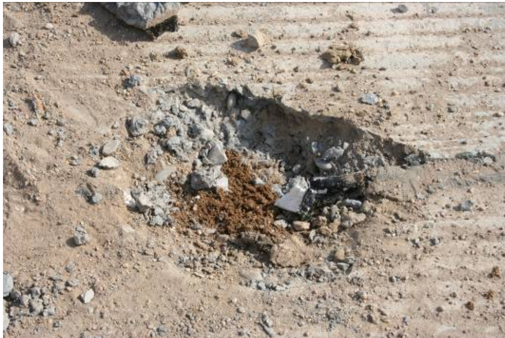
Site Photo 20. Roadway where piece was removed.

Patchwork installations should conform to applicable flatwork standards in terms of materials and workmanship. The team observed numerous examples of concrete patchwork that was either too thin or placed unevenly and not to code. Site Photo 21 shows an example of such work.