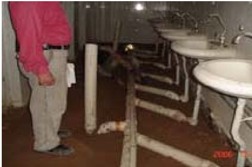
Site Photo 25. Reducers and fittings, before rework, were not water tight (Photo courtesy of ECC).

In another very similar example, dormitory building D-4 was accepted via DD1354 on 9 December 2005, but a serious plumbing leak was not reported by QA personnel until 20 April 2006. A photo taken by the government representative on 20 April 2006 shows that substantial water volume migrated subsurface within the second story floor to the outside walls of the building (Site Photo 26).