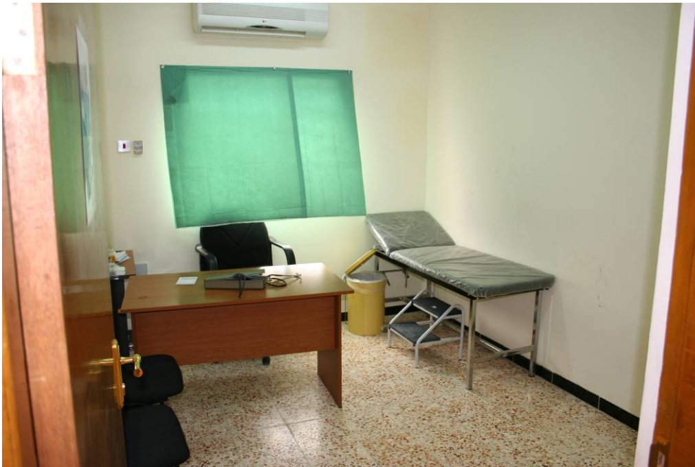
Site Photo 15. Patient evaluation room in clinic.