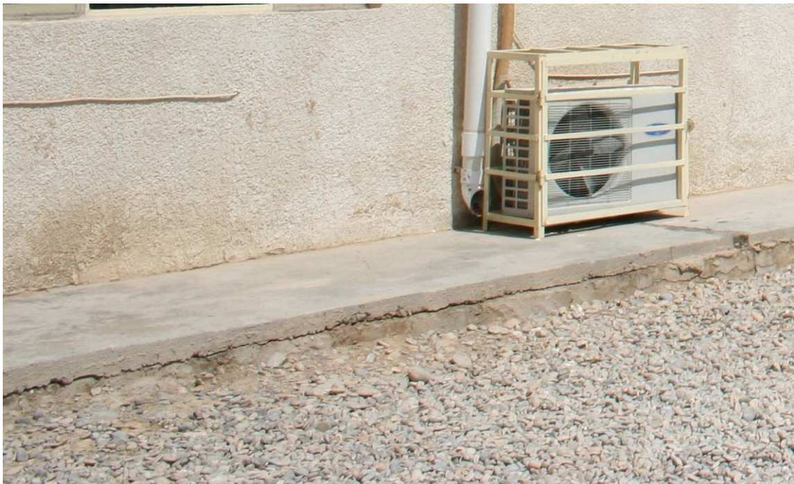
Site Photo 22. Horizontal fracturing along foundation of middle barracks.

During the site visit, the team observed horizontal fractures that ran along almost the entire perimeter of the newly constructed middle and eastern barracks building foundations. Site Photos 22 and 23 show the described fractures. In addition, similar, but less obvious, horizontal fissures were observed on the second floors of the dormitories.