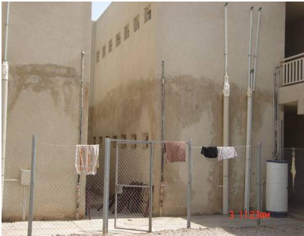
Site Photo 26. Water stains from improper plumbing (Photo courtesy of ECCI).

In another very similar example, dormitory building D-4 was accepted via DD1354 on 9 December 2005, but a serious plumbing leak was not reported by QA personnel until 20 April 2006. A photo taken by the government representative on 20 April 2006 shows that substantial water volume migrated subsurface within the second story floor to the outside walls of the building (Site Photo 26).