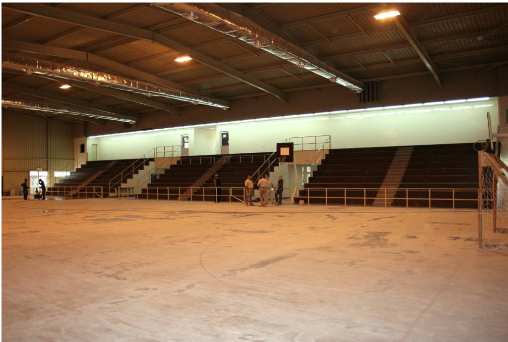
Site Photo 17. Renovated gymnasium.

Many construction deficiencies, which ranged from minor to serious, were observed and photographed during the site visit. Examples included paint overspray on lights, windows, and door hardware; poor quality masonry work; crumbling concrete; improperly installed light fixtures and bathroom doors; exposed electric wiring; and poor quality hardware throughout the facility that was rusting or breaking after only a few months of use. Much of the observed workmanship and materials quality did