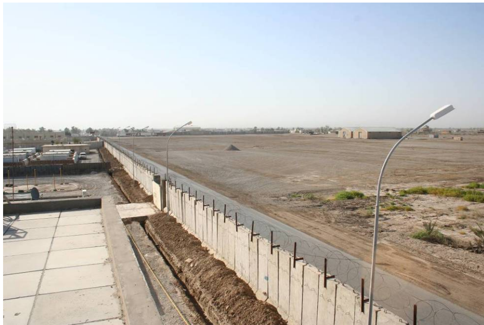
Site Photo 3. “T” wall fence, lights, and gate.

The assessment team found that perimeter security for this project was complete at the time of the assessment. In lieu of the CMU block wall specified in the SORS, pre-cast reinforced concrete T walls, approximately three meters (m) tall were used to construct the security wall. Although different, the pre-cast T wall construction appeared to be consistent with the intent of the SOW. A roll of concertina wire was secured on top of the perimeter wall. While different from what was specified in the SORS, the assessment team found that the concertina wire should be effective and should meet the intent of the SOW. The ECP was complete and consisted of a personnel barrier, vehicle barrier, and a guard post staffed with armed guards. The ECP operations appeared effective. Three other gated entrances provided emergency and backup entrance to and egress from the facility. Although the team did not observe the facility after dark, the perimeter lighting system in-place appeared sufficient. Site Photos 3 and 4 show the perimeter security including “T” walls, lighting, gate, and concertina wire.