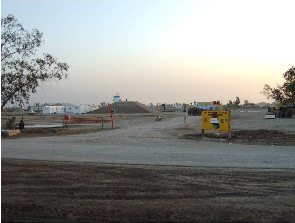
Site Photo 1. Site pre-construction (Photo courtesy of ECCI).