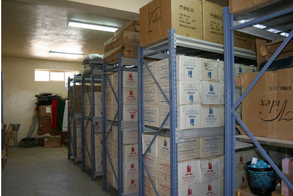
Site Photo 16. Supply warehouse.