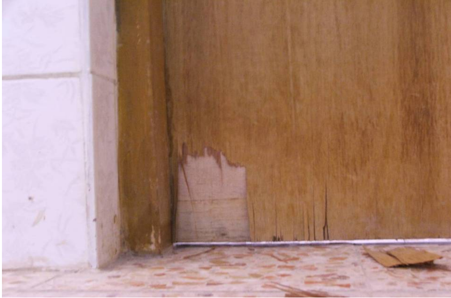
Site Photo 29. Water damaged door installed too close to the floor.