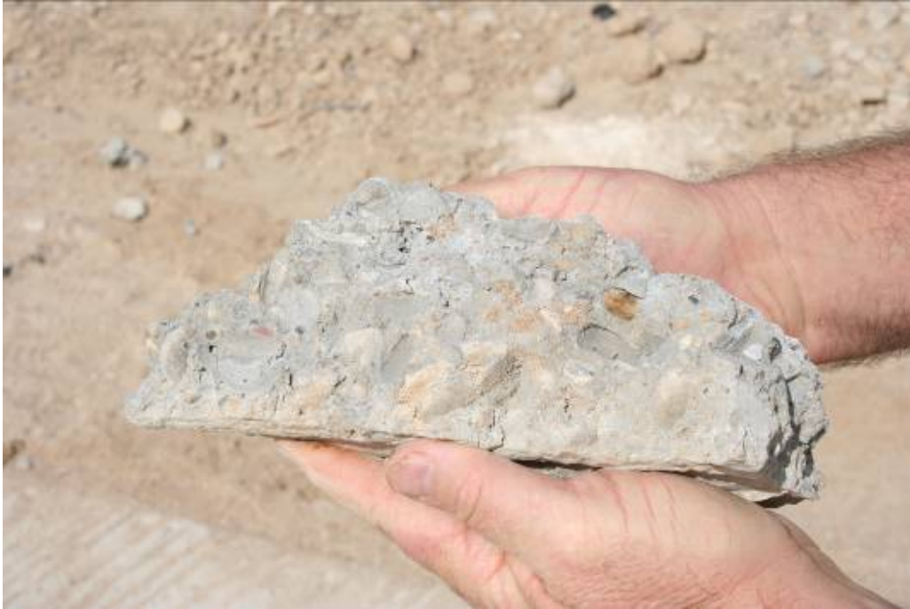
Site Photo 19. Concrete piece pulled from roadway by hand.