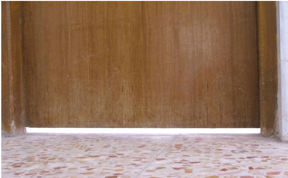
Site Photo 30. Undamaged door hung with sufficient clearance.

The assessment team observed numerous examples of installations not meeting standards, which if not corrected could lead to significant safety issues. For example, an electric wire splice (Site Photo 31) should have been enclosed in a weather proof box to comply with required codes. In addition, an electric breaker box installed on an exterior wall not sealed from the weather (Site Photo 32) could short-circuit and start a fire or cause serious injury.