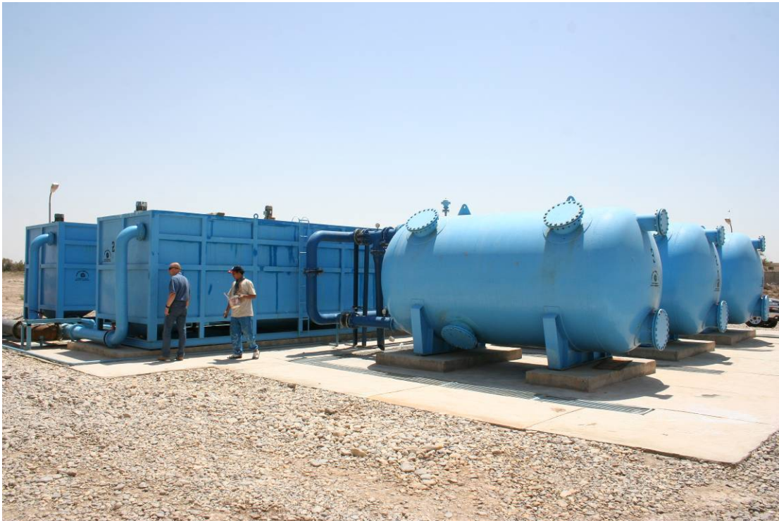
Photo 5. Drinking water treatment plant.

At the time of the assessment, the water treatment and distribution system was complete. Water was pumped from the Tigris River to the treatment plant that included three clarification tanks, a chlorination system, pumps, sand filters, and support equipment. Treated water was pumped to holding and pressurization tanks to facilitate distribution. The water treatment system appeared to meet the intent and requirements of the contract. The water treatment system is displayed in Site Photos 5 and 6.