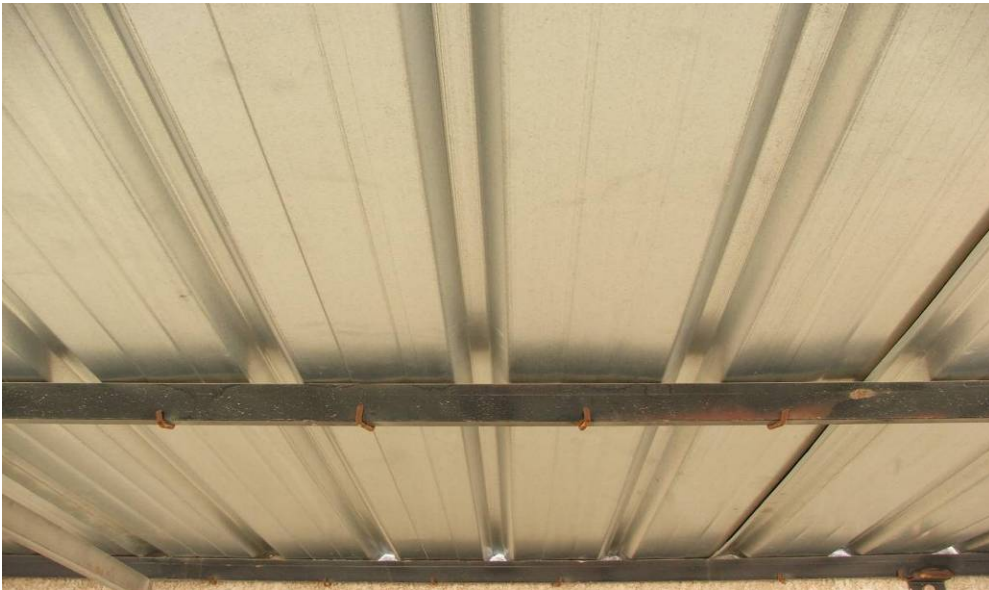
Site Photo 28. Tin laid flat with sufficient number of fasteners.