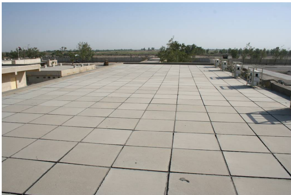
Site Photo 13. IP area cadet barracks rooftop.