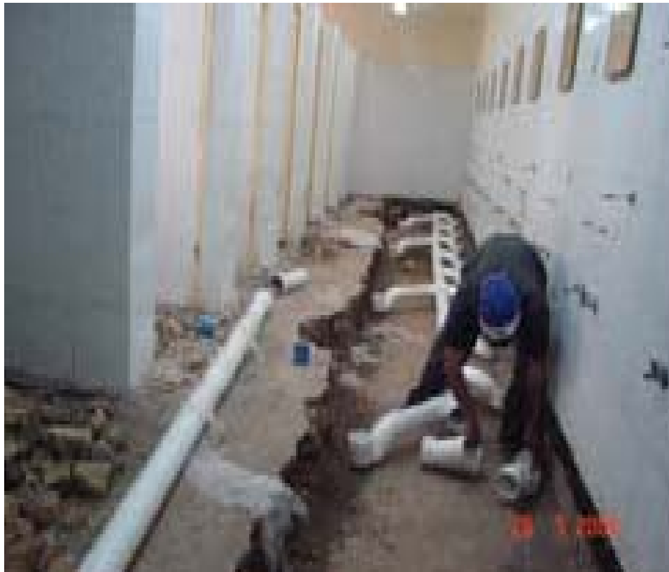
Site Photo 24. Extensive rework in progress.

As a result, routine construction deficiencies not detected and corrected as they occurred turned into much larger rework issues. For example, dormitory building D-1 was accepted via DD Form 1354 dated 31 August 2005. However, extensive rework was required within the bathroom to correct the defective construction that should have been detected, monitored, and corrected during construction (Site Photo 24). Specifically, the connections between the smaller diameter feeder drain lines and the larger diameter main drain line system were not water tight because positive connection (glued or threaded) reducers and fittings were not used until the deficiency was corrected in March 2006 (Site Photo 25).