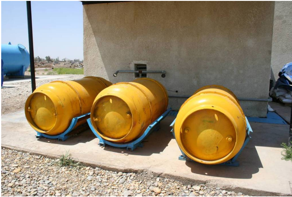
Site Photo 6. Water treatment plant chlorination system.