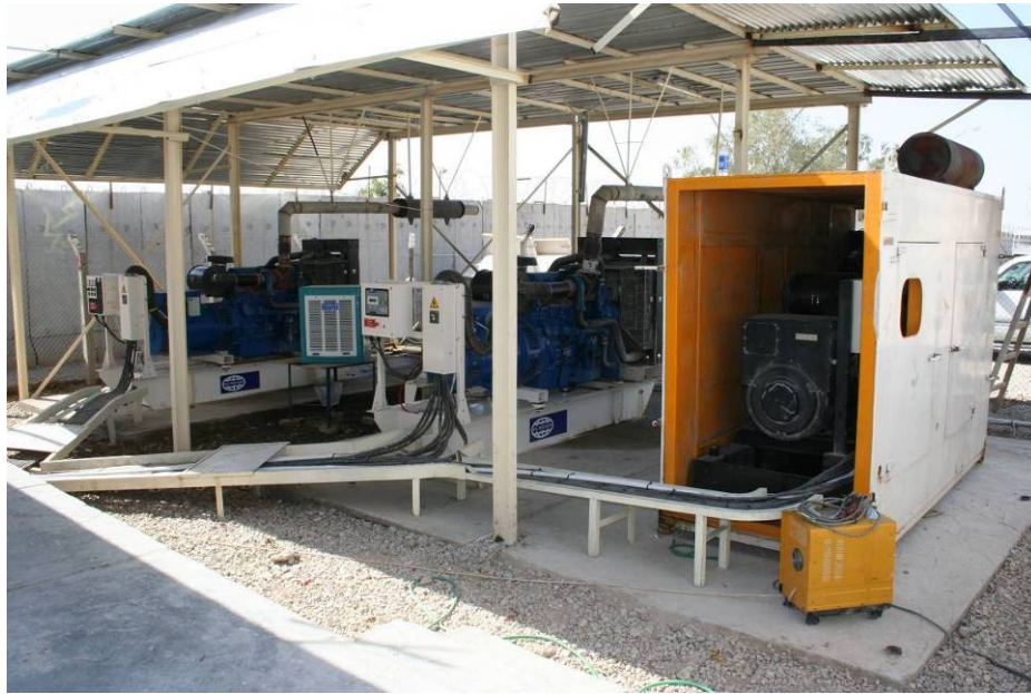
Site Photo 8. Two-500 KW (left) and one-400 KW (right) ING area generators.

In addition, the SORS required the contractor to design and construct a separate electric power generating and distribution system to meet the needs of the ING area. The team found that the contractor installed two-500 KW generators to meet the separate needs of the ING compound. In addition, one-400 KW generator was on site and in the commissioning process during our site visit. The additional 400 KW generator will provide increased power production and emergency backup capabilities for the ING area. Site Photo 8 shows the ING facility generators.