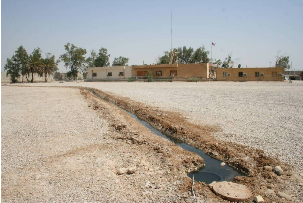
Site Photo 11. Surface ditch moving waste water from septic tank manhole to “Dead River”.

The site assessment disclosed that the main source of the waste water overflow was a septic tank manhole. As a temporary solution to the standing waste water problem, the contractor excavated a surface ditch to drain overflow from the manhole source through the facility to a storm water drainage ditch which empties into a nearby reed filled canal referred to as the “Dead River”. The overflow drainage ditch is shown in Site Photo 11.