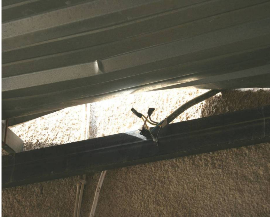
Site Photo 31. Unsafe electric wire splice not secured in an enclosed box.