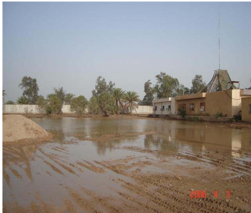
Site Photo 10. Standing waste water (Photo courtesy of ECCI).

Rather than utilizing a drain field system, the permeable septic tanks were designed to depend on pump trucks to remove excess effluent. However, the contractor's design did not meet requirement because it did not support academy needs in terms of daily volume. When coupled with insufficient soil drainage and limited pump truck capacity, substantial excess waste water overflowed from the septic system. Site Photo 10 shows waste water overflow standing on academy grounds.