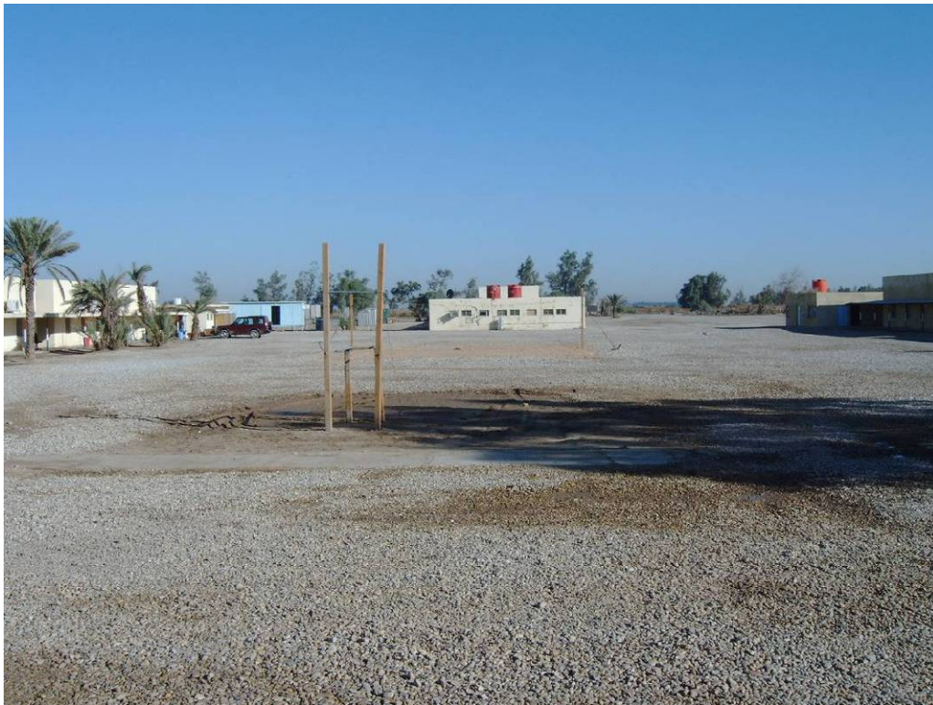
Site Photo 2. Site pre-construction.