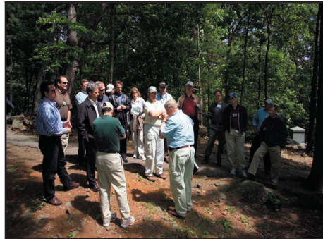
The Moog Inc. Space and Defense Control Group pause during their tour of the Gettysburg Battlefield.

On May 22-24, Moog, Incorporated's Space and Defense Control Group from East Aurora, New York arrived for a ride hosted by the USAWC. Moog, Inc. is a worldwide manufacturer of precision control components and systems. Moog's high performance actuation products control military and commercial aircraft, satellites and space vehicles, launch vehicles, and automated industrial machinery.