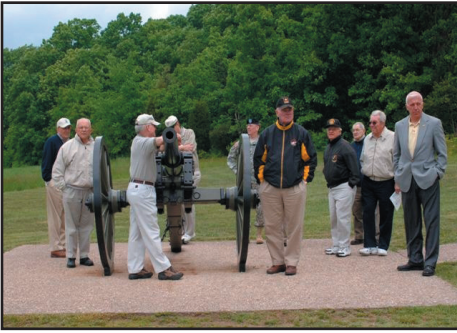
The Secretary of the Army's civilian aides at Gettysburg.