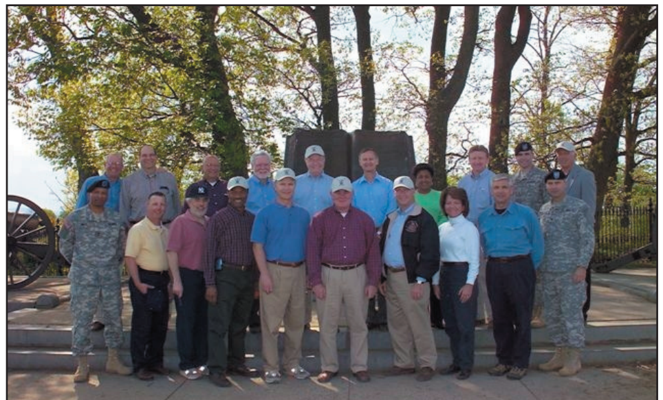
The Honorable Francis Harvey, Secretary of the Army (front row center), and his staff pause before the High Water Mark Memorial during the Gettysburg Staff Ride.

The Secretary of the Army and his principal staff joined the USAWC on April 24-25. This initial program is the first in what the Secretary intends to be an annual event that will include Civilian Aides to the Secretary of the Army to discuss the challenges of strategic-level leadership with the intent to increase awareness and exchange insights on strategic issues and assist in supporting the Secretary’s strategic communication program. The group spent the day grasping the strategic lessons