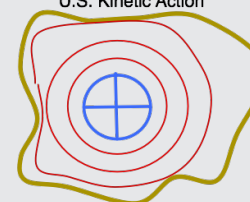
Insurgent I.O. based on U.S. Kinetic Action

Insurgents also leverage the ripples of the U.S. stone. Insurgents also seek to leverage the informational effects of U.S. kinetic actions. When the U.S. throws a stone, the insurgents are busy spinning the informational ripples – “see the civilians killed by the occupier?” The insurgent’s spin is more powerful when there is no counter-message, that is, when the U.S. ignores the informational sequel to its physical acts.