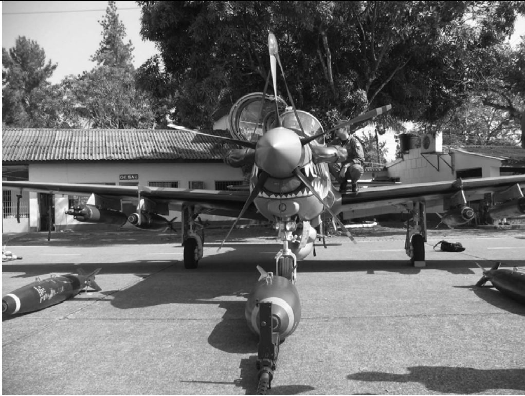
Colombian A.29 Super Tucano on static display at Apiay AB, Colombia. The A.29 is an example of the kind of aircraft envisioned as an OA-X.

“For those missions that still require manned missions, we need to think hard about whether we have the right platforms—whether, for example, low-cost, low-tech alternatives exist to do basic reconnaissance and close air support in an environment where we have total control of the skies—aircraft that our partners also can afford.”