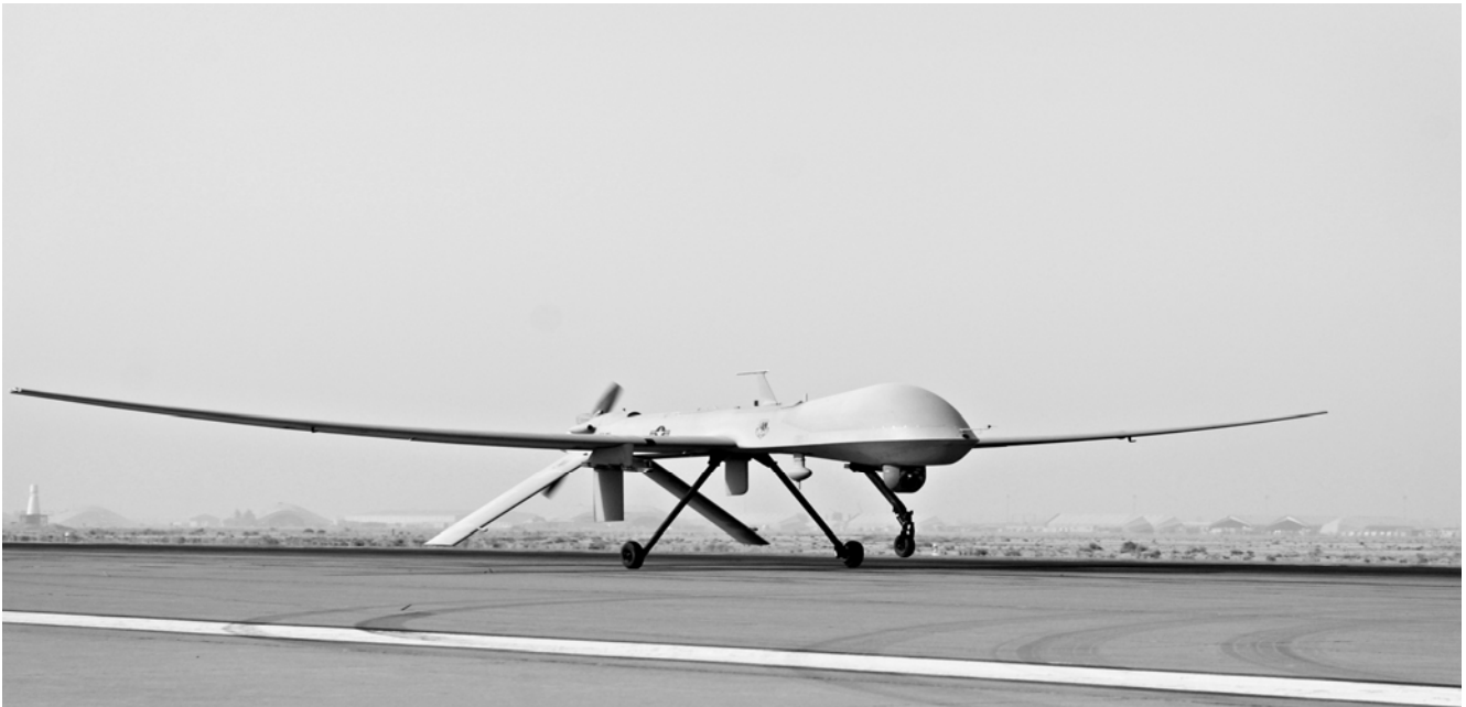
A MQ-1B Predator unmanned aircraft from the 46th Expeditionary Reconnaissance Squadron takes off from Balad Air Base, Iraq, 12 June 2008.

“A principal reason many of our partner nations cannot effectively deal with terrorism and guerilla insurgency is precisely because they only possess ground-based militaries and because they have little...to offer in the way of airpower to find, fix, and finish critical...targets.”