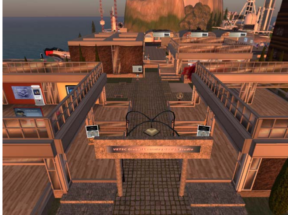
Figure 12. Virtual view of Huffman Prairie depicting Design Studio facility and Machinima stages.