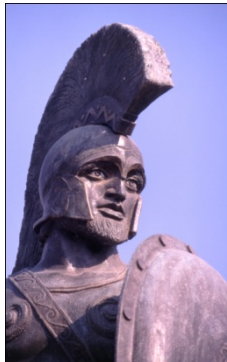
Figure 1. Statue of Leonidas.

The outboard motor sputtered to a stop as the tour boat eased up next to a wooden pier. I stepped off and quickly surveyed the shoreline of an inlet surrounded by rocky cliffs and rolling hills. 1 Looking ahead I spied a narrow pass with a stone monument among a jumble of rocks—the destination of my journey. The sky is clear blue and scruffy laurels mark my path to the stone monument. I catch a glance at hot springs nearby and move closer to read an inscription on a stone monument marking the entrance to the pass from the sea: