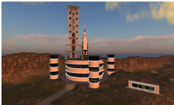
Figure 10. Virtual view of Huffman Prairie Sigma and the Mars Exploration Challenge Game launch facility.

Huffman Prairie Sigma . This region supports expedition challenge-based learning involving the use of real-life challenges wherein learners can apply knowledge and problem-solving skills while journeying towards a destination. Expedition challenges are designed to help learners uncover important relationships about applying knowledge. Visitors can experience a prototype expedition challenge in the form of a journey to Mars. The journey starts by riding a 3-stage rocket to a deep-space craft for the trip to Mars. During the expedition participants work on a challenge addressing options for future human flight in space. The rocket launch facility also contains additional information on the learning framework used for the challenges.