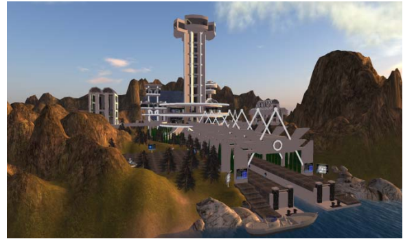
Figure 11. Virtual view of Huffman Prairie Gamma depicting informatics tower, clinic and library.

Huffman Prairie Gamma . This region supports the exploration and prototyping of educational informatics applications. Educational informatics melds the study of informatics science with analysis of learning information and knowledge, to address the interface between technology, learning, and assessment sciences in the design of interactions between natural and artificial systems (Scheessele, 2007; Stricker, Lorenzi, & Scribner, 2009). As an interdisciplinary field, educational informatics, focuses on information, data, and knowledge in the domain of education—their storage, retrieval, and optimal use for problem-solving and decision-making in support of how people learn, instruct, and discover new knowledge.