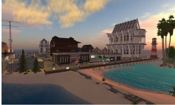
Figure 4. Virtual view of Huffman Prairie and the Virtual Educational Technology Support Center.

assessment sciences in the form of virtual booklets. An illustrative virtual digital library (Arthur's Reading Room) is also located on this region. Visitors can also take a tour of twelve learning environment prototypes using the teleport tour board located in front of VETSC.