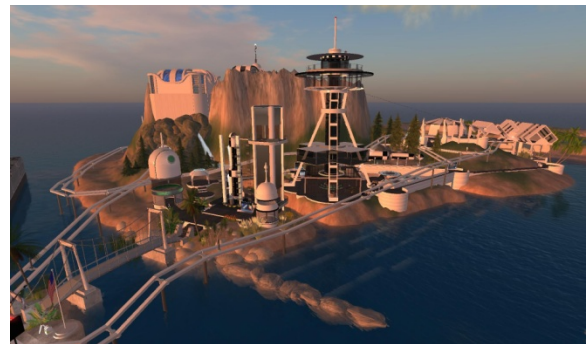
Figure 9. Virtual view of Huffman Prairie Omega and the General Bernard A. Schriever Rocket Launch Learning Center.

Visitors can ride a monorail and skylift to access various resources available throughout the region. The monorail travels inside the mountain range wherein visitors can explore several 3D object resource repository collections. Visitors can obtain copies of the 3D objects from the collections. A visitor center is located on the eastside of the region along with an online status and communication board for contacting staff members for assistance.