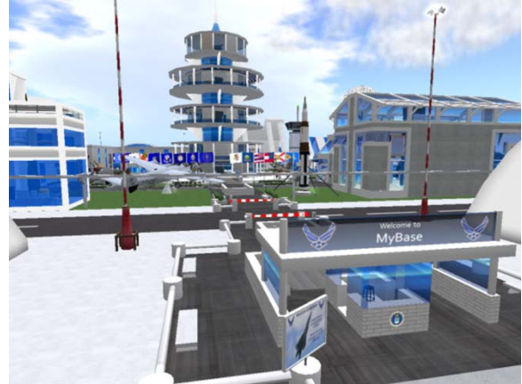
Figure 5. Virtual view of MyBase public front gate entrance, Air Force museum and visitors center.

U.S. Air Force website can be accessed, by clicking on a virtual computer, to interact with a person to discuss opportunities with the U.S. Air Force.