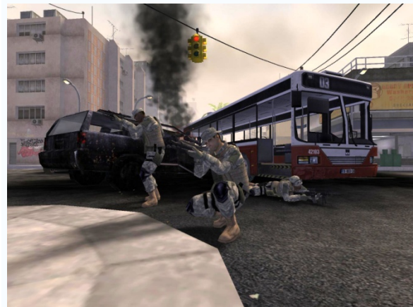
Figure 2. View from America’s Army .

America’s Army . America’s Army is a multiplayer, team-oriented, first-person shooter game with the participant acting as a soldier, at the squad level, in the U.S. Army.