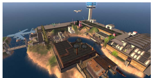
Figure 6. Virtual view of Captain Lance P. Sijan Leadership Range supporting 3D world games for learning.

This area of MyBase Zeta serves as a test bed for simulation gaming for education in support of scenario-based learning and authentic assessment practices. Explore the game set that supports the Operation Relief Worker Rescue Challenge simulation game conducted on the Captain Lance P. Sijan Leadership Range on the region. The current game set configuration is used to instruct teams on interdependent leadership (Hughes & Stricker, 2009). The set includes an abandon U-boat base, remote village, underground tunnels, warehouses, and an Air Operations Center for game officials.