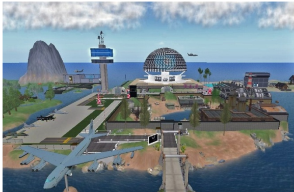
Figure 7. Virtual view of MyBase Zeta airfield.

MyBase Zeta, Airfield . This area of MyBase Zeta contains a virtual airfield supporting a number of representative Air Force aircraft, piloted aerial vehicles, skydiving, and aerial tours. An air control tower supports virtual flights along with several aircraft hangars. Aircraft squadrons, color-coded for teams, are also provided in support of the Lance P. Sijan Leadership Range game scenarios. Virtual C-130s can also be launched from this area and can fly missions across the Air Force regions and in support of game scenarios. Visitors are also encouraged to visit the virtual Air Operations Center (AOC) located on the far northeast area of the airfield. The AOC is located on the 2nd floor of the range operations depot building.