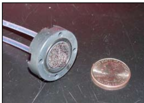
FIGURE 1 NRL's mini-MFC (anode chamber shown).

Mini-MFC Accomplishments: As shown in Fig. 2, the mini-MFC generates the highest power per volume when using the three most popular cathode reactions: (a) oxygen reduction catalyzed by bare graphite, (b) reduction of ferricyanide, and (c) oxygen reduction catalyzed by Pt-modified graphite. These results were all obtained by using a pure culture of S. oneidensis , a bacterium known for its low energy conversion efficiency. All non-NRL results displayed in Fig. 2 utilize either a more energy efficient organism (in the bare carbon example) or mixed consortia of bacteria (ferricyanide and Pt cathode examples) that can more completely oxidize electron donors and nutrients avail-