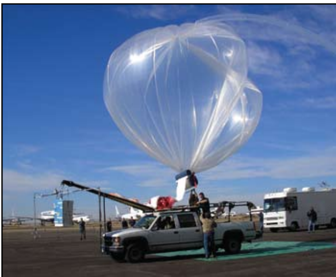
FIGURE 1 Launching of NRL payload by AFRL personnel in Roswell, NM, November 2005.

Data throughputs for the PRC-117F radios were 9600 bps maximum, due to limitations in the radio's IP