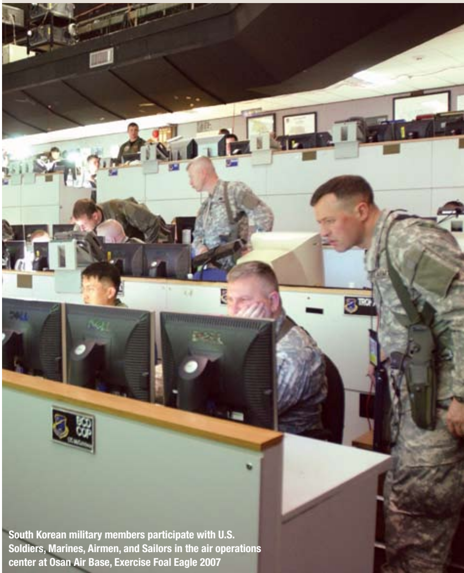
South Korean military members participate with U.S. Soldiers, Marines, Airmen, and Sailors in the air operations center at Osan Air Base, Exercise Foa Eagle 2007

—Lieutenant General Walton H. Walker, Commander, 8 th U.S. Army, Korea, 1950 1