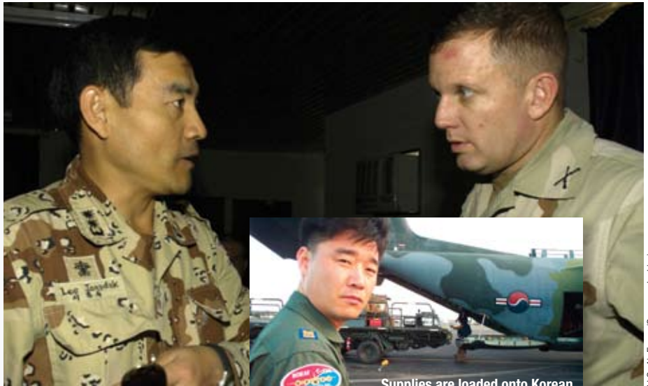
Republic of Korea air force security advisor speaks with U.S. Army officer in Kirkuk, Iraq

Develop and Codify Procedures. The planning processes for both the ATSP concept and the ATSP field training exercise have provided unique opportunities to identify gaps in current policies and procedures. For example, as a result of the field training exercise, the Working Group identified a lack of codified procedures for combined pallet buildup and cargo loading. Resolution of this issue has now become a C4 Transportation priority. Similarly, ATSP play in various command post exercises uncovered a need for a more structured method of selecting ATSP locations and their respective SAAs and BOS-Is, which, in turn, could work in tandem with future command, control, and communications plans, processes, and time cycles. C4 Transportation, in concert with C4 Plans, devised a decision-tree process for this purpose for approval by the ATSP Working Group, and this process will soon find a home in the next edition of the C4 Logistics, Policies, and Procedures. As these procedural gaps arise, planners should convene the necessary working groups and operational