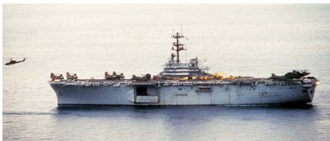
USS Guam (LPD 9)

of Mogadishu would require transfer to a safe port. Could he bring them back to Oman, or would he have to send his ships to other locations—such as Mombasa, Kenya, or the island of Diego Garcia—even farther from the scene of action? Additionally, commanders throughout the fleet remembered the 1990 evacuation