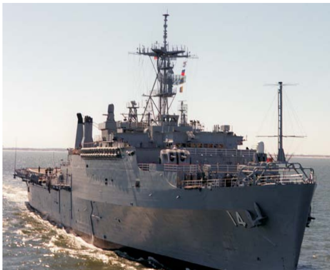
USS Trenton (LPD 14)