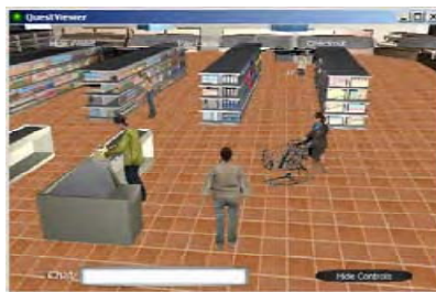
Figure 1c. Veteran and Therapist Avatars in Store