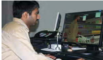
Figure 1a. Simulated Veteran with Avatar