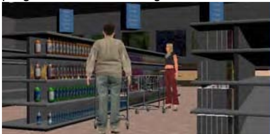
Figure 1 a: Two avatars shopping

At of these goals have been met (Figure 1). In addition, the AP has also met to evaluate the progress to date and give further suggestions. Currently they are satisfied with the direction and progress to date, and urge us to seek further funding to continue our work.