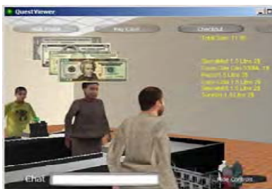
Figure 1f. Checkout. Veteran Menu at Top