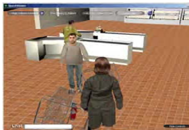
Figure 1d. Grocery Cart Collision. Therapist Menu at Top