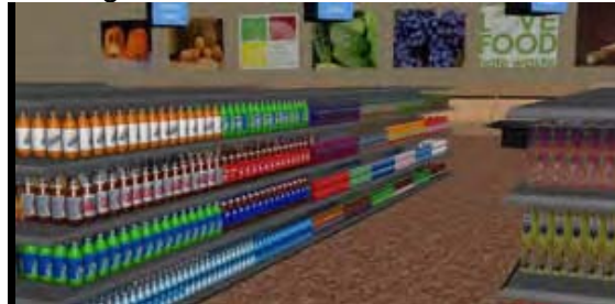
Figure 1 b: An aisle of the store.