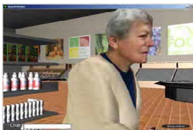
Figure 1e. "Bot" shopper