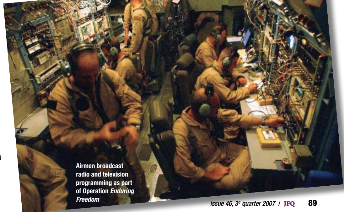
Airmen broadcast radio and television programming as part of Operation Enduring Freedom