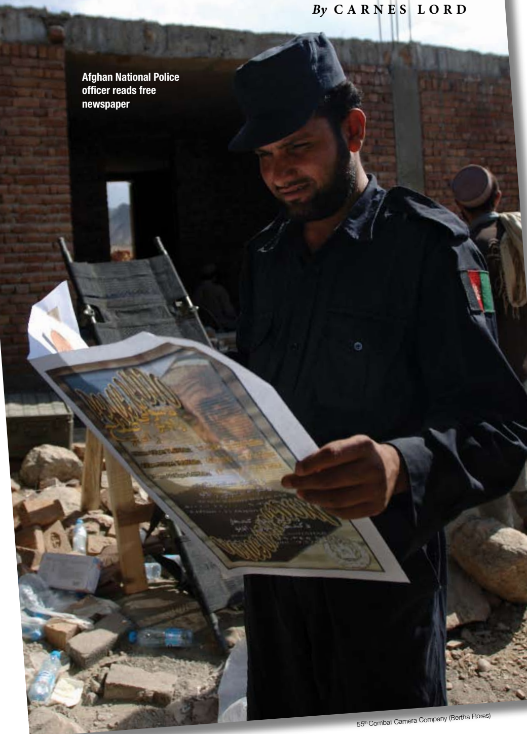
Afghan National Police officer reads free newspaper