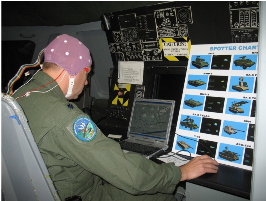
Figure 1. The WASM experimental station in the CSIL facility.

Demographic data/background questionnaire. This questionnaire was used to collect information in order to characterize the participant's prior experience and demographic characteristics and assist in interpretation of participant's performance on the target acquisition/weapons assignment task. Items elicited information about participant's sex, age, general health, vision (i.e., correctable to 20/20 acuity, normal color and peripheral vision), wellbeing, experience with simulator-type environments, video game experience.