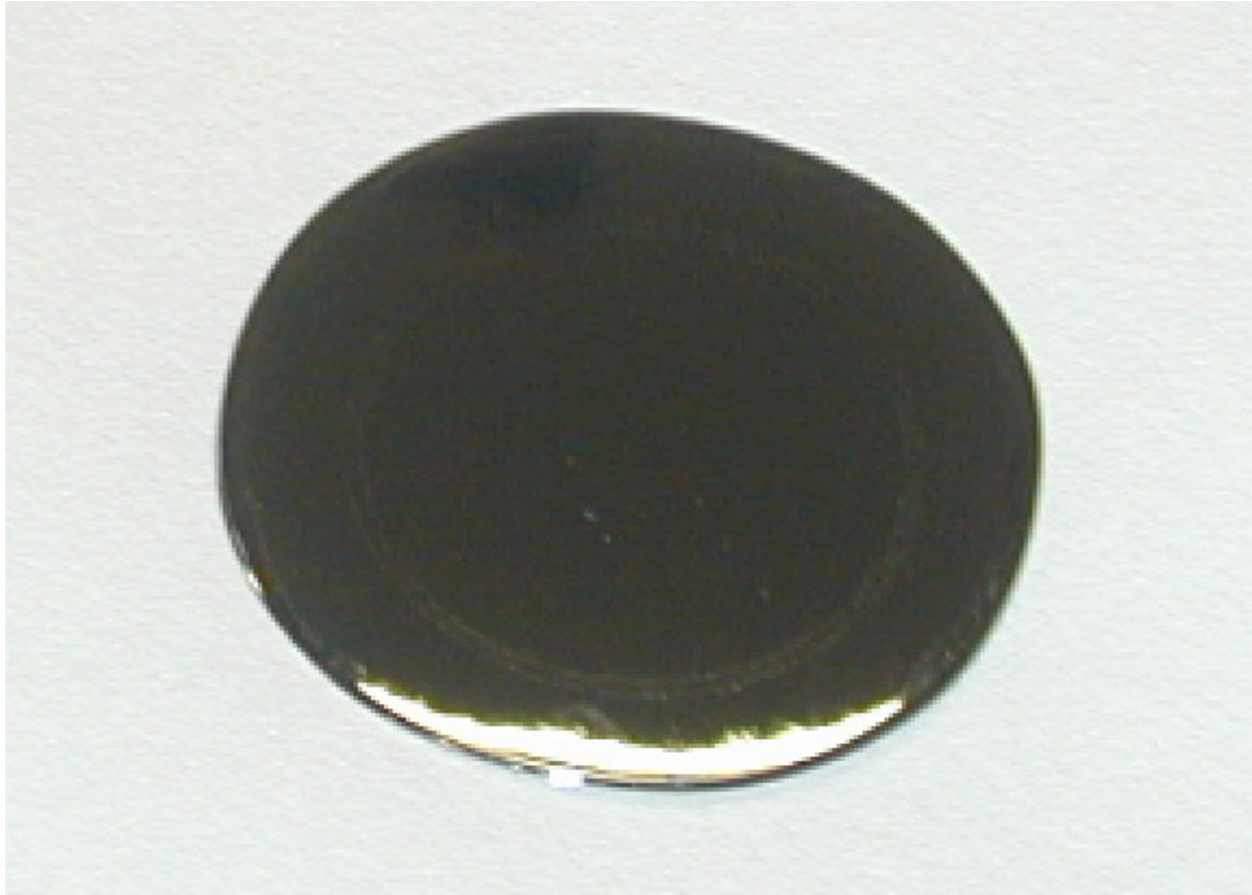
Figure 2. A 1-mm thick planar test detector has a segmented lithium-diffused contact visible on the top surface. The contact withstood ~ 4000 V/cm electric field and segmented with several hundred G \Omega .