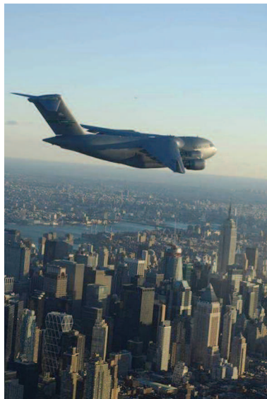
Figure 7. C-17 transcontinental flight using a synfuel blend.

The Air Force is developing an Assured Aerospace Fuels Research Facility to support the study and evaluation of how processing and upgrading operations, conditions, and catalysts impacts the production, characteristics, quality, and carbon dioxide (CO 2 ) footprint of jet fuel made from alternative sources. Joint studies sponsored by the Air Force and the Department of Energy (DOE) show potential life cycle CO 2 reductions below that of conventional petroleum if waste biomass is combined with coal to produce aviation fuels via Fischer-Tropsch (FT) processing. This facility will enable the Air