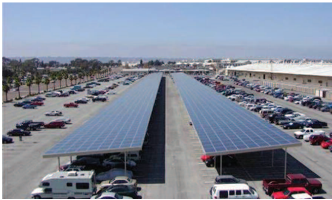
Figure 6. Photovoltaic parking garage at Naval Base Coronado, North Island, California.