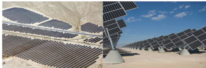
Figure 5. Nellis Air Force Base solar array.

ing, ventilating, and air conditioning systems) in the training area (see Figure 4). These structures demonstrate a holistic approach that can provide an estimated energy savings of about 60%. This proof of concept effort was intended to make forward operating bases energy independent for power generation.