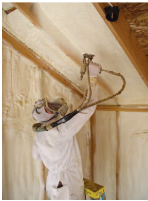
Figure 2. Installing foam insulation on houses at Ft. Belvoir.

wedges. The effort involves 4,200 light fixtures, each of which uses approximately 20 W less energy, yielding a total energy savings of 376,000 kWh/year (i.e., for one-fifth of the Pentagon). The fixtures are expected to last about 11.5 years, resulting in a net savings of about $4 million over the life of the fixtures.