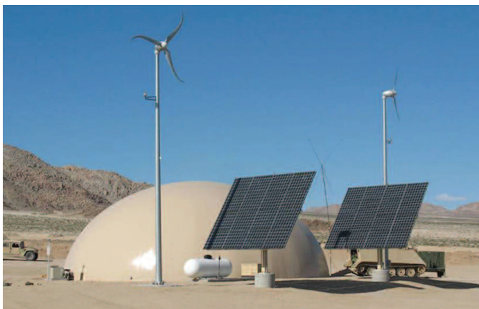
Figure 4. Monolithic dome and renewable energy generator at NTC.