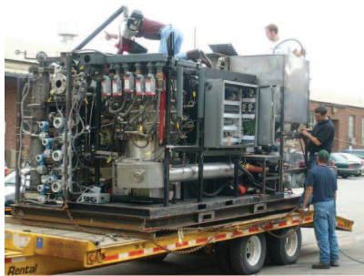
Figure 10. Tactical Garbage to Energy Refinery (TGER).

to power a 60 kW generator. A battalion sized forward operating base (600-800 soldiers) creates about one ton of garbage per day that can be recycled into energy, so the system is designed to convert one ton of waste into energy equal to about 100 gallons of JP-8. It is skid mounted and deployable on a military 5-ton flatbed trailer.