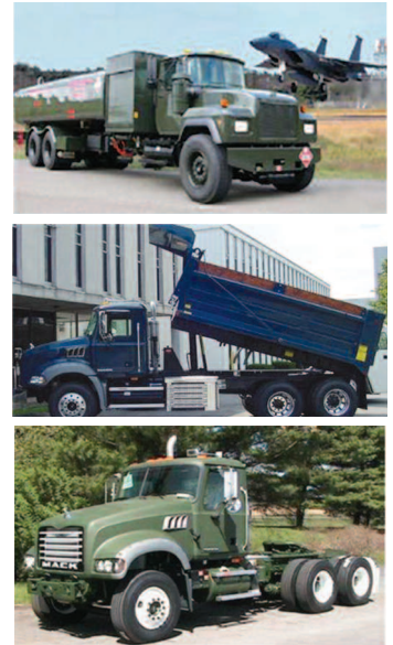
Figure 3. Diesel hybrid vehicle testing at Hickam AFB.

In an effort to demonstrate the operational efficacy of demand reduction coupled with alternative/renewable power, the PSTF and the NTC installed energy efficient structures (domes, spray-foam insulation, renewable power generator, and efficient heat-