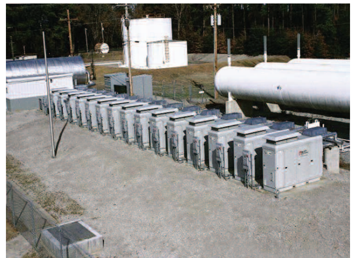
Figure 9. Hi-Power generator at Ft. Belvoir, VA.

ciency for use with various mobile and portable applications in the 2 to 500 kW range.