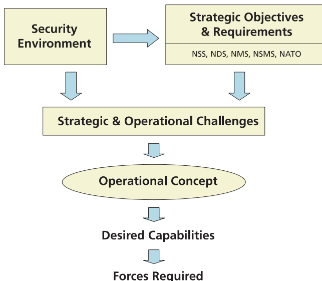
FIGURE 1 PLANNING METHODOLOGY AND PROCESS

Note: An expanded view of the third box in Owens, "Strategy and the Logic of Force Planning," fig. 2, "The Logic of Force Planning," p. 490.