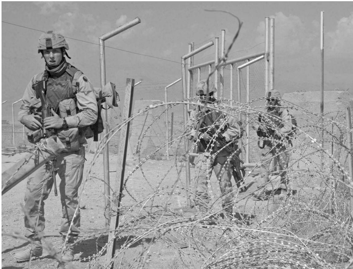
Soldiers from Company B, 3rd Battalion, 116th Infantry Regiment, Virginia National Guard, conduct a patrol outside of Bagram Airfield, Afghanistan. The 116th Infantry Regiment is currently stationed in Afghanistan in support of Operation ENDURING FREEDOM.

operations, but even under the most extreme circumstances there were no major incidents with the 13,000 sorties that came in and out of these LZs. This is a testament to the abilities of the highly trained teams that provided this critical service.