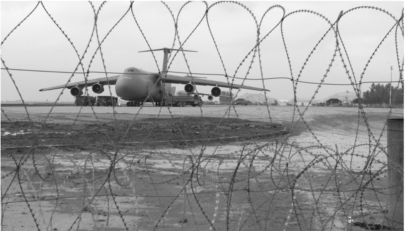
Balad Air Base, Iraq—A C-5 Galaxy sits on the ramp. The runway is large enough to allow the aircraft to use the airfield, which reduces the base's dependence on ground-vehicle convoys for supplies.