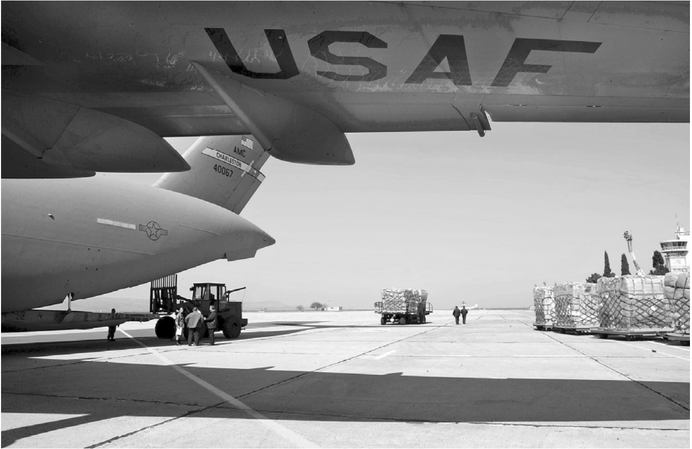
Loading C-17.

By MAJ Brent Legreid, USA Langley AFB, VA