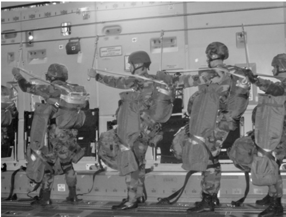
Air Force airborne engineers ready to jump into a joint training exercise.

What can be done to free up the seizing force to expand the front line or lodgment? As the airlands begin rolling in, who will handle the materials, marshal reinforcements, and command and control the aircraft. The Air Force has recognized that this is their role and is standing up units to accomplish it.