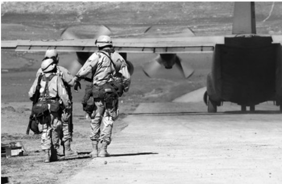
Operation IRAQI FREEDOM—Security forces members from the 786th Contingency Response Group veer off the road to avoid the dirt blown up by a C-130 aircraft leaving the airfield located in Northern Iraq.

The Air Mobility Command (AMC) is the air component of the United States Transportation Command and is responsible for providing airlift, air refueling, special air mission, and aeromedical evacuation for the Department of Defense. AMC executes a daily average of 270 air missions moving as many as 2,000 passengers and 600 tons of cargo each and every day—that's an average of one airlift mission every 2 minutes on a normal day, with surge numbers that are considerably higher. Recently, AMC enhanced its ability to conduct expeditionary mobility operations by creating a completely new type of organization—a Contingency Response Group (CRG).