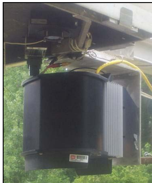
Figure 1. The polarized illuminator (below center) is mounted offset from the MICA camera head (a portion is shown top left).

Illumination Components. The primary component of this illumination technology is the high-power (20 W)