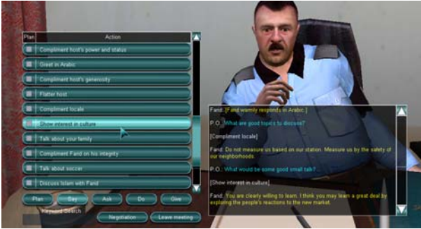
Fig 2. Screen shot from a BiLAT meeting

In order to interact with the simulated counterpart, the player chooses from a menu, with options sorted into one of four categories – “Say” (e.g., Greet in Arabic), “Ask” (e.g., Do you know why people are not using the market?), “Do” (e.g., remove sunglasses), and “Give” (e.g., offer first aid kits). Each successful meeting engagement consists of an opening phase, a negotiation phase, and a closing phase. Since each of these scenarios is set in an Iraqi context, it is important for the trainee to follow local Iraqi social customs throughout the meeting engagement (i.e., do not attempt to get down to business until sufficient social niceties have been exchanged and/or the counterpart brings up a topic related to the objective). If the proper steps are not followed, the virtual character will react negatively (e.g., exhibit frustration and eventually, anger). If the trainee persists in not following the appropriate cultural norms, the meeting partner may terminate the meeting.