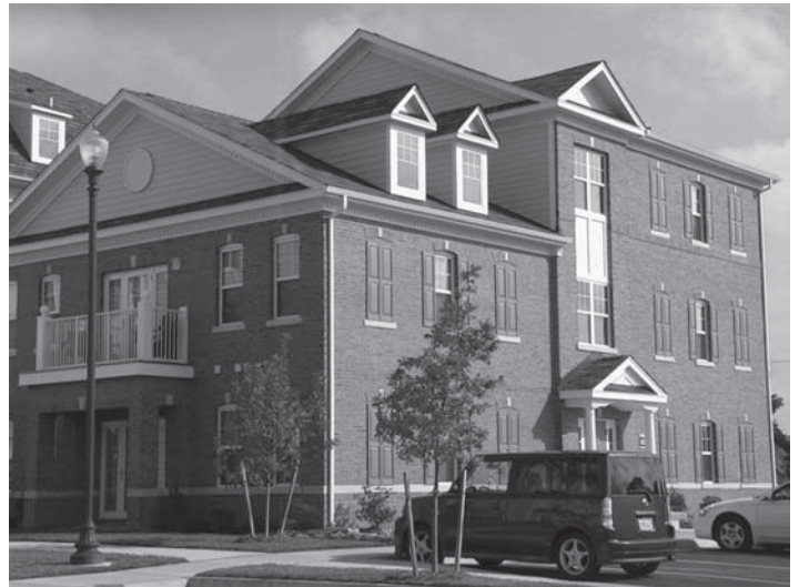
A separate housing unit built with wood-frame construction