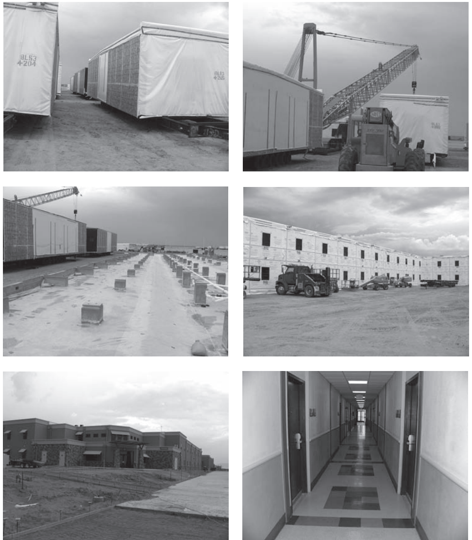
Figure 6: Use of Modular Construction to Build a Barracks at Fort Bliss, Texas