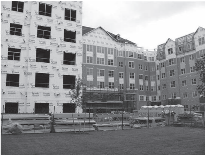
A midrise building being constructed with noncombustible materials