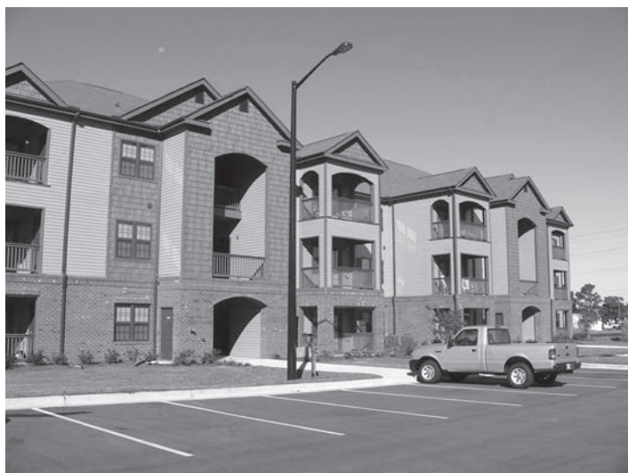
Figure 5: Privatized Senior Unaccompanied Personnel Housing Project at Fort Bragg, North Carolina