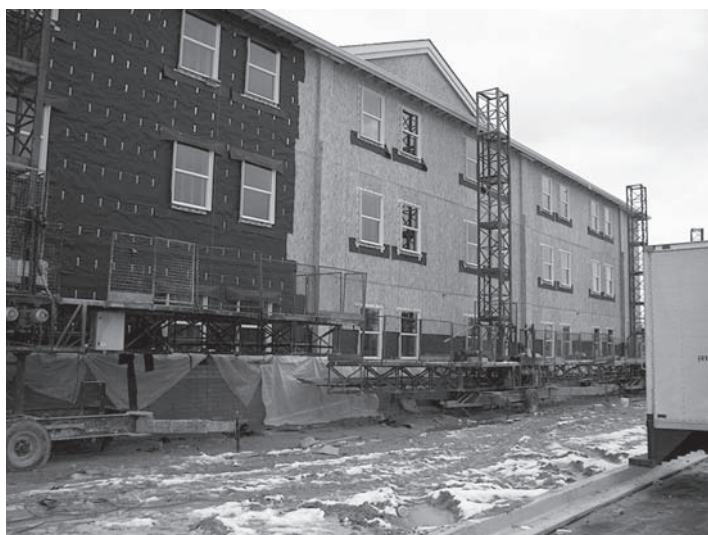
The project under construction using wood materials in 2003