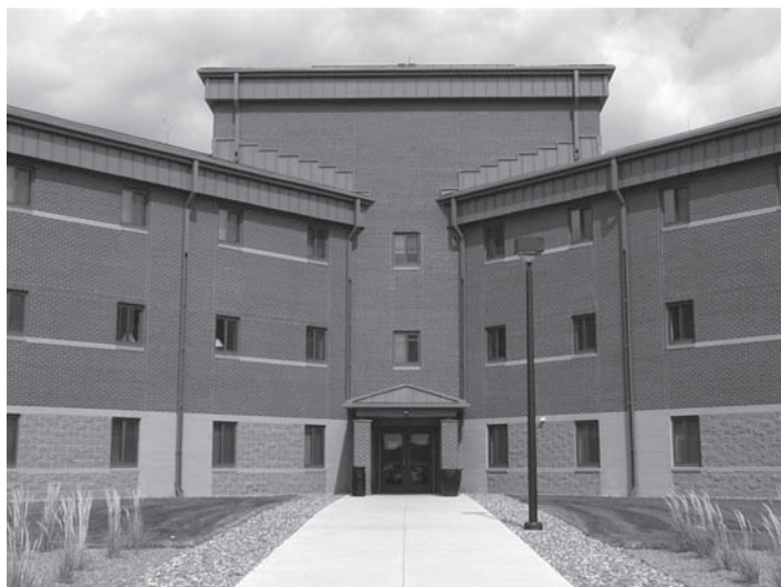
Figure 2: Wood-Frame Barracks at Fort Carson, Colorado

To gain some insight into the economic merits of the Army's increased use of wood materials and modular construction, we reviewed available information related to initial facility construction costs depending on the materials and methods used to construct new buildings. We found evidence that the use of wood-frame construction can result in lower initial building costs. For example, we found that the Army apparently had achieved construction cost savings by using wood-frame construction in several barracks projects that were initially designed to be built with steel, concrete, and masonry. To illustrate, according to Army officials, a fiscal year 2006 project at Fort Carson to construct a barracks and company operations facility was estimated to cost about $35 million based on actual contract bids and the use of steel, concrete, and masonry construction. After switching the barracks' design to wood-frame construction and resoliciting the project, the officials stated that the project was subsequently awarded for about $24 million, a savings of about $11 million, or 31 percent in estimated costs (see fig. 2).