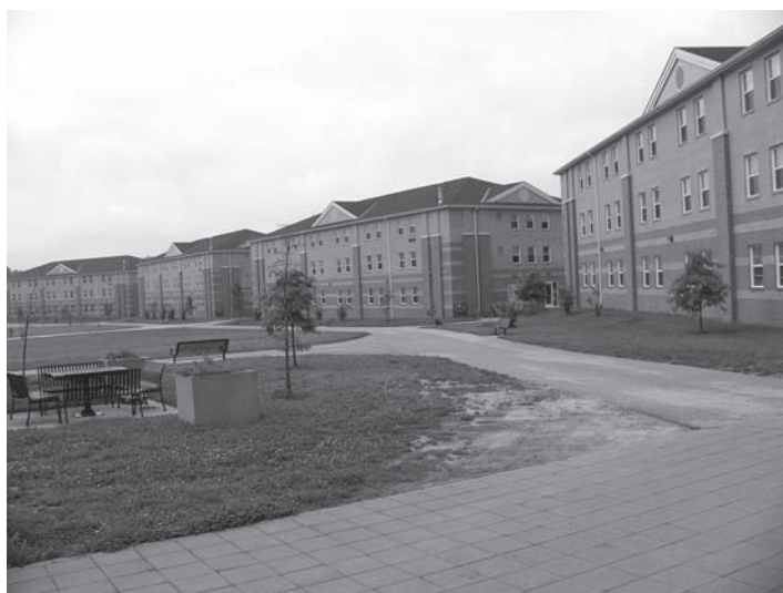
A portion of the completed project