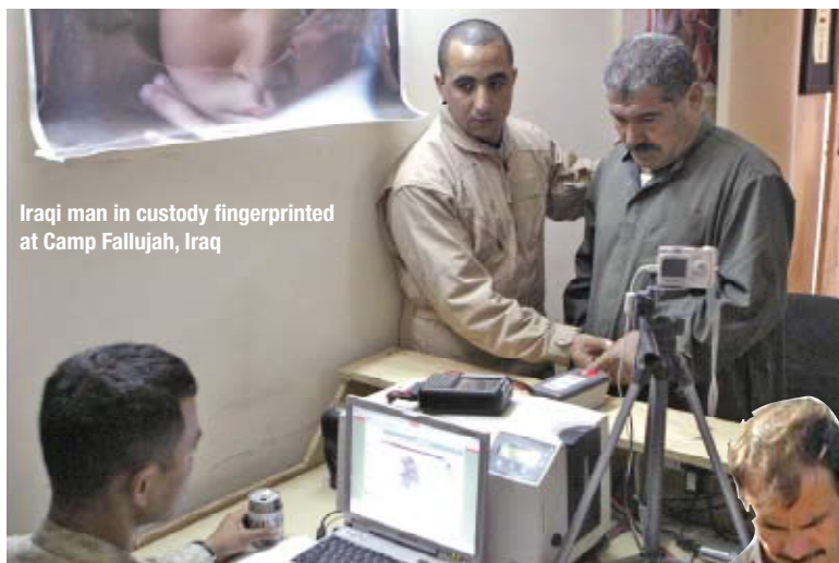
Iraqi man in custody fingerprinted at Camp Fallujah, Iraq

using the skills of modern technocrats, al Qaeda has adopted online tactics that mirror its offline techniques for evading discovery