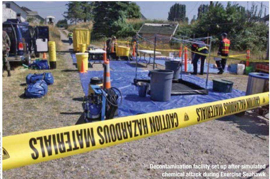
Decontamination facility set up after simulated chemical attack during Exercise Seahawk

By serving as the day-to-day, 24-hour conduit that links frontline law enforcement, and even foreign officials, to critical field intelligence on terrorists, the TSC staff can