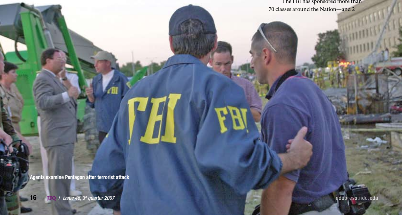
Agents examine Pentagon after terrorist attack