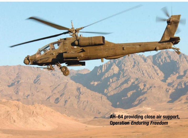
AH-64 providing close air support, Operation Enduring Freedom