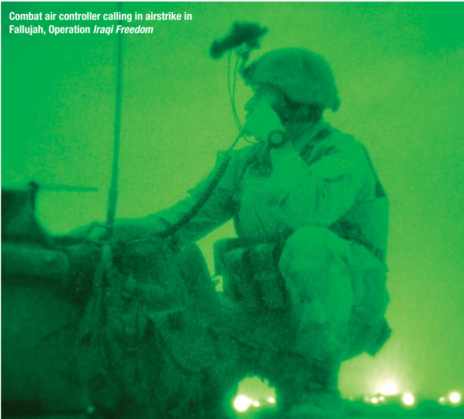
Combat air controller calling in airstrike in Fallujah, Operation Iraqi Freedom