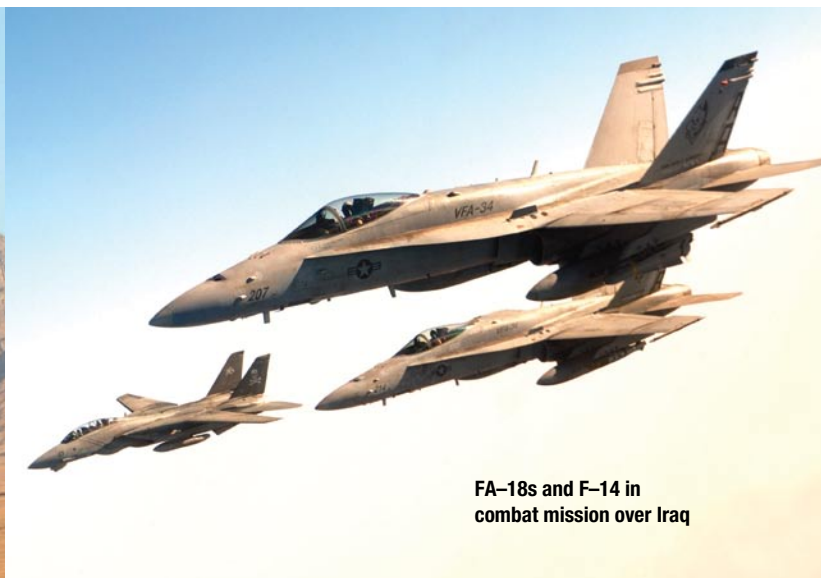
FA-18s and F-14 in combat mission over Iraq