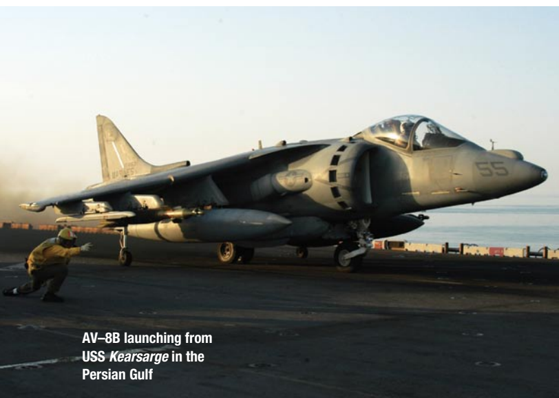
AV-8B launching from USS Kearsarge in the Persian Gulf