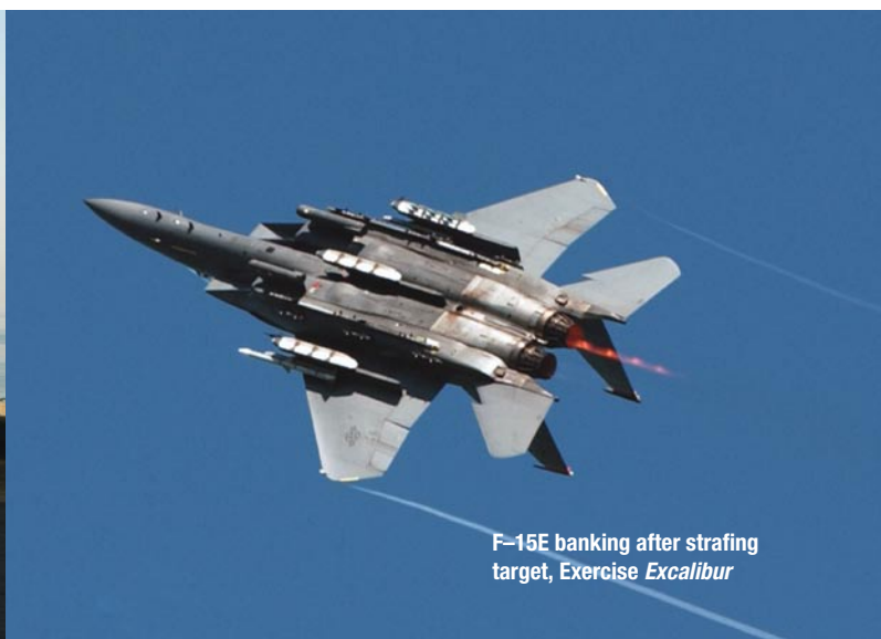
F-15E banking after strafing target, Exercise Excalibur