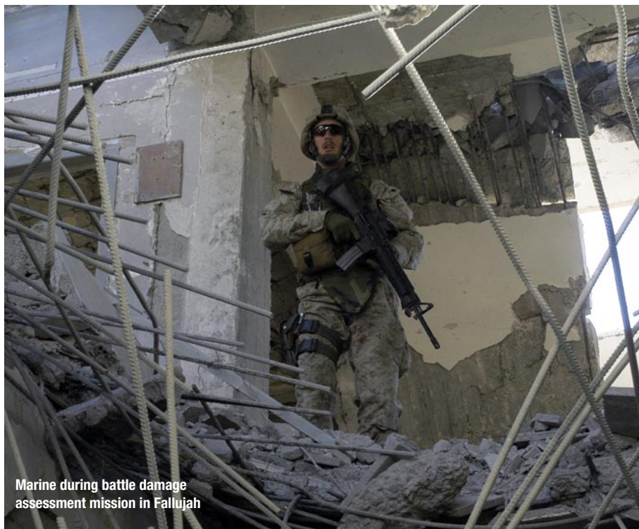
Marine during battle damage assessment mission in Fallujah