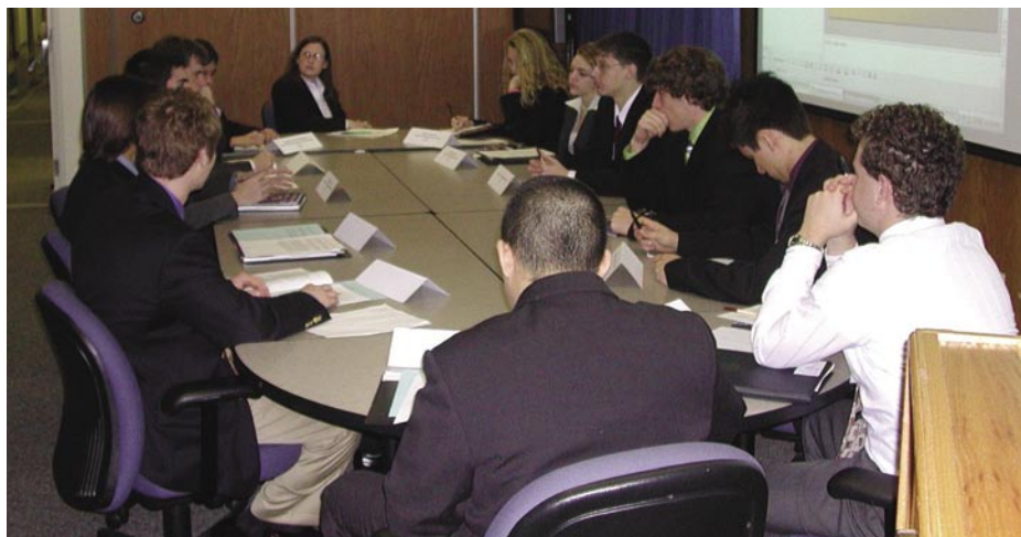
High school students in the National Youth Leadership Forum engage in simulations at the Gaming Center

Quality game design and the relevance of the problem being gamed determine how useful exercises are to participants. The National Strategic Gaming Center unites both in the exercises it builds and executes, underpinning its standing as a premier national gaming center. JFQ