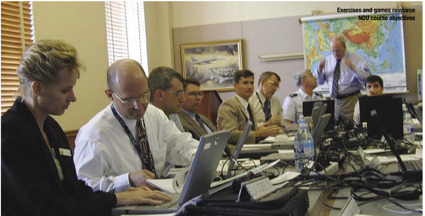
Exercises and games reinforce NDU course objectives