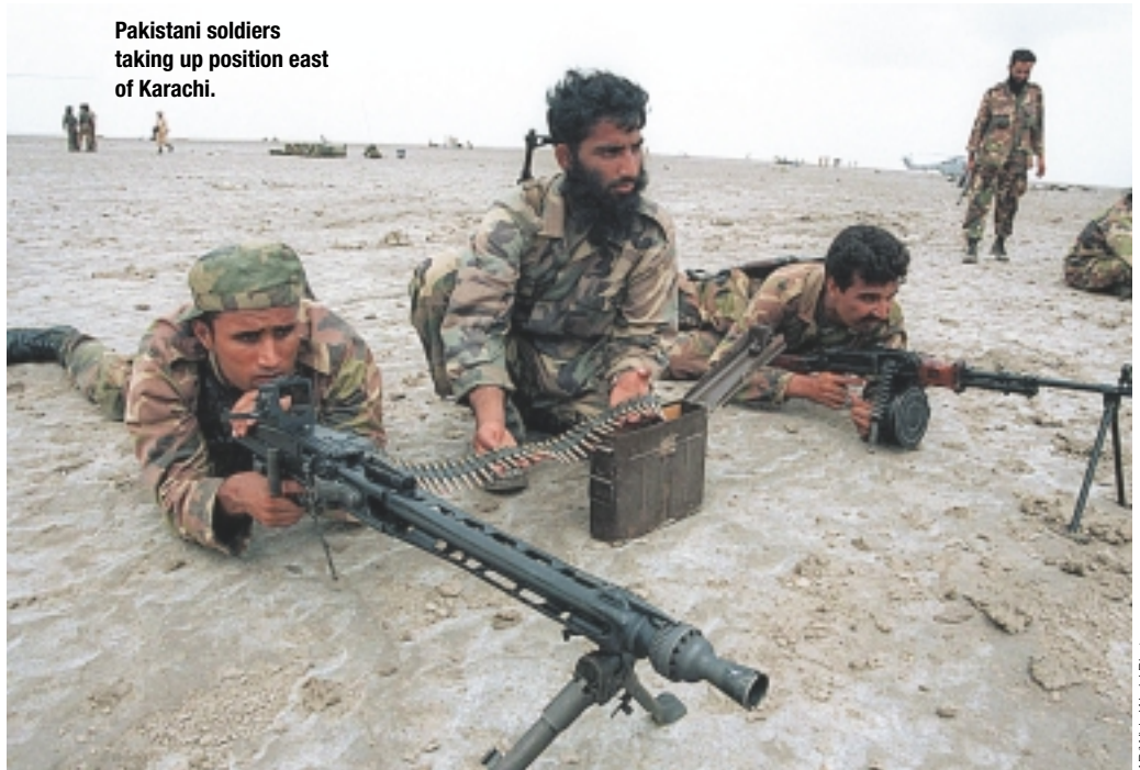
Pakistani soldiers taking up position east of Karachi.

Following the Soviet invasion of Afghanistan, Washington provided $500 million annually in military and economic assistance to Islamabad. Although aid was contingent on certification of Pakistan's nuclear energy program, verification was little more