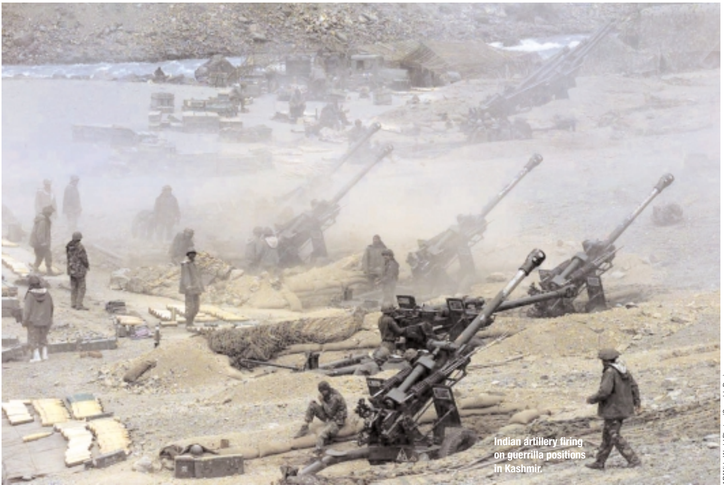
Indian artillery firing on guerrilla positions in Kashmir.