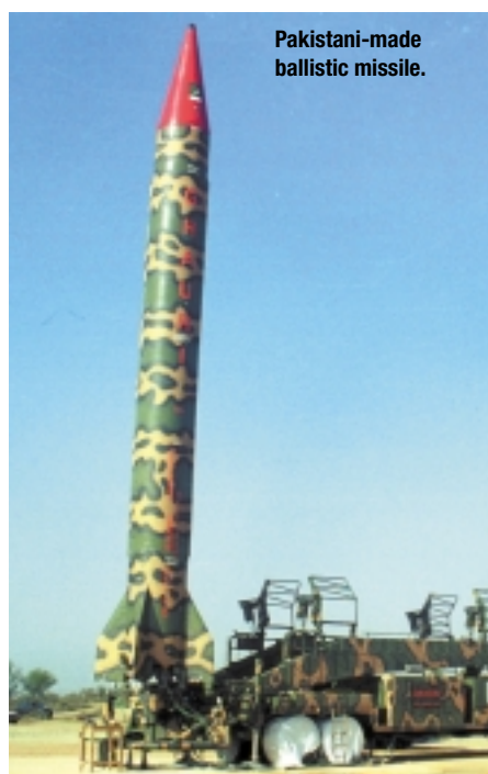
Pakistani-made ballistic missile.