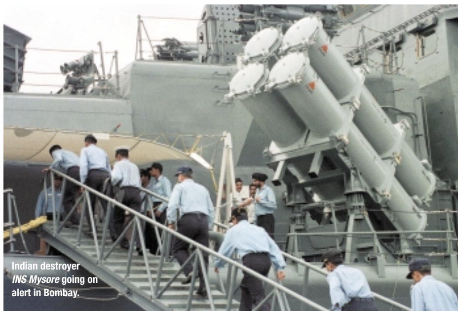
Indian destroyer INS Mysore going on alert in Bombay.

The United States described the termination of arms transfers as even-handed. In fact, though it was not a