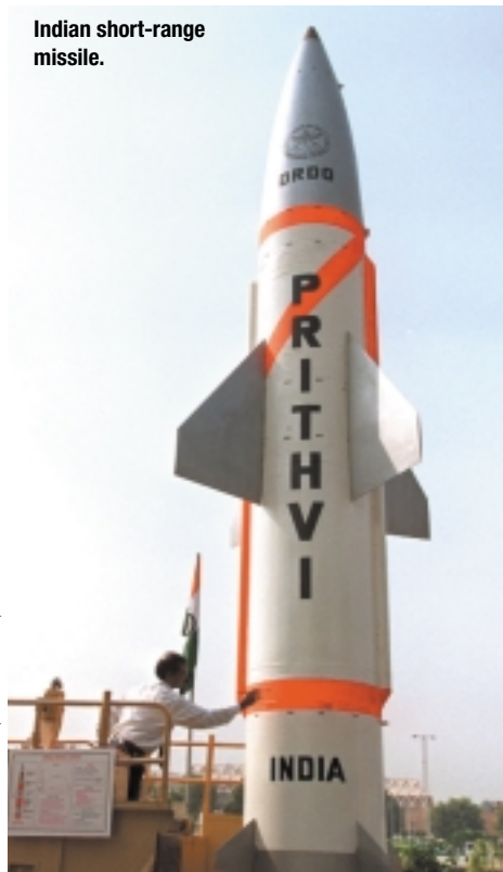
Indian short-range missile.