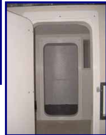
Exterior and interior views of composite shelter built to replace existing Stony units.