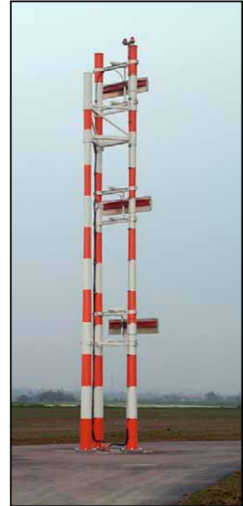
Proposed Composite Glideslope Tower