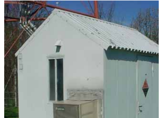
USAFE metallic shelter to be replaced