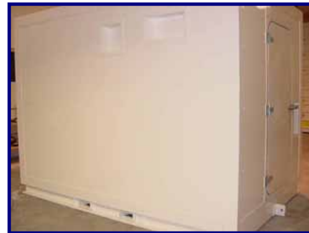
Exterior view of composite shelter designed for Yukon site replacement.