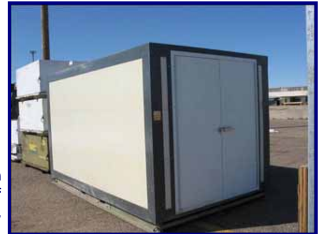
Composite shelter design for replacement of USAFE shelter.