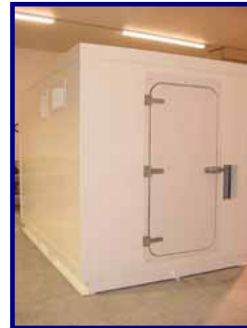
Existing Stony TIS site.