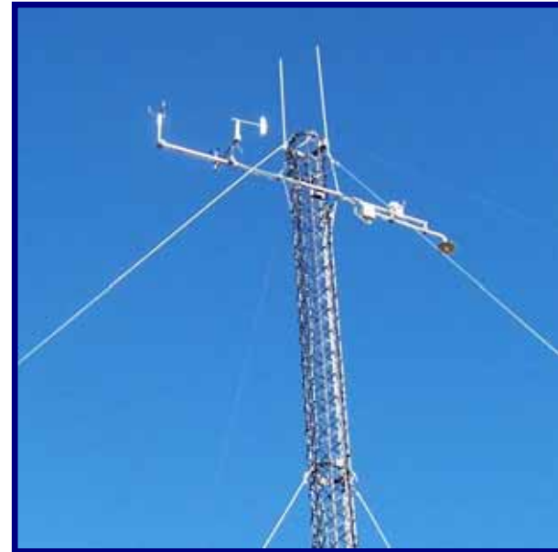
Newly erected composite ISOTRUSS Tower (VAFB)