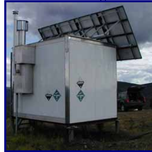
Existing Yukon TIS site.