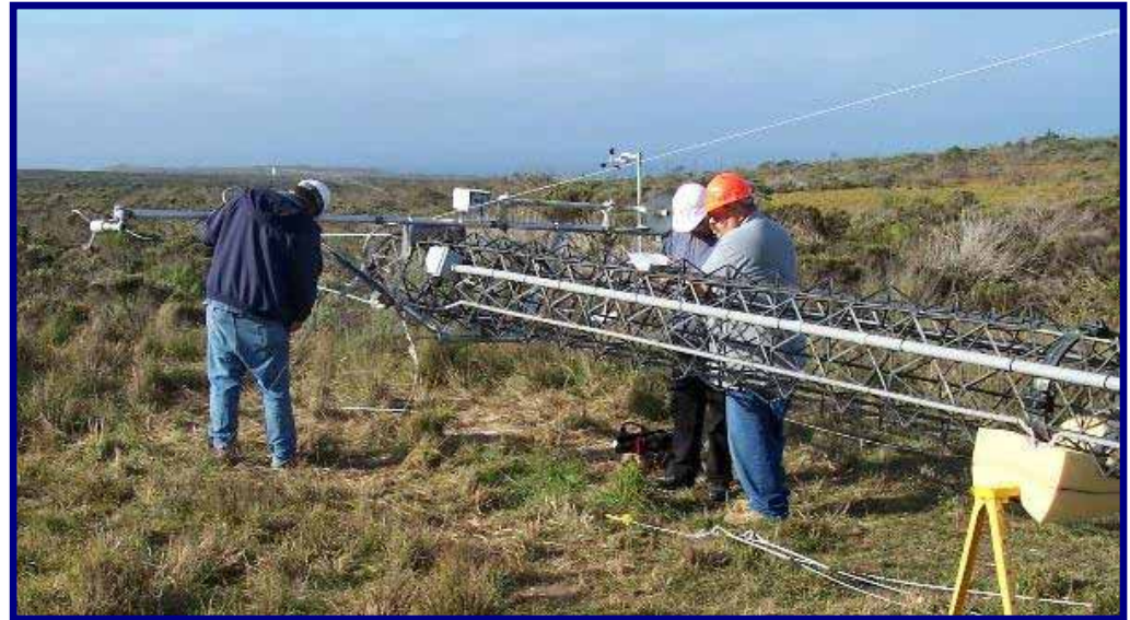
Tilt-down tower facilitates easy service