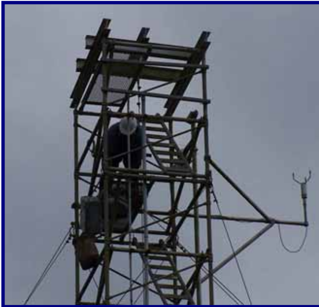
Corroded staircase weather tower (VAFB)