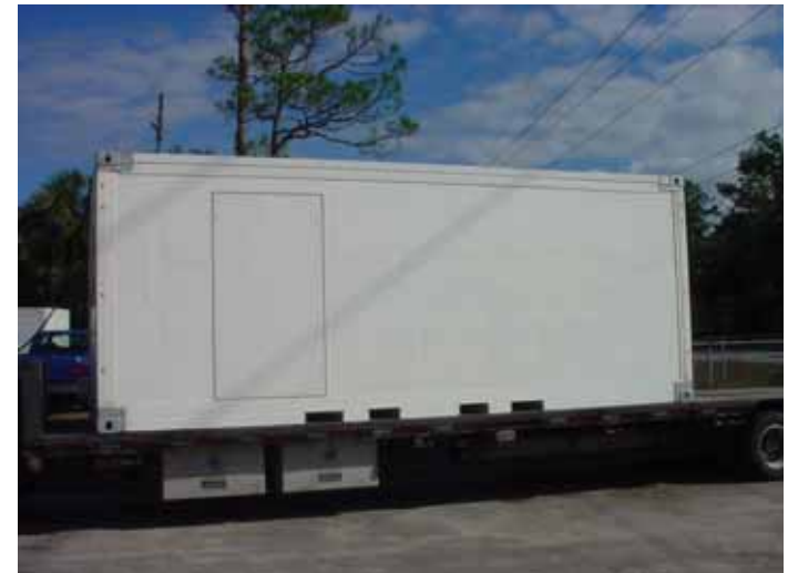
Joints of Thermoplastic ISO Shelter Prototype, Thermoplastic Prototype Shelter