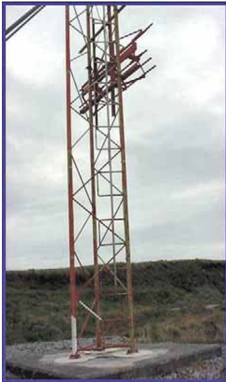
Corroded Glideslope tower (GUAM)