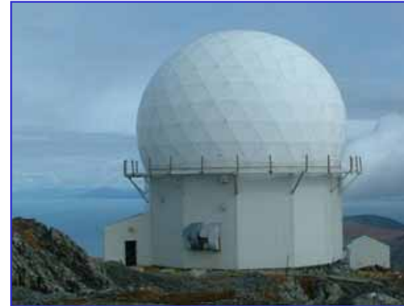
Cape Newenham, AK