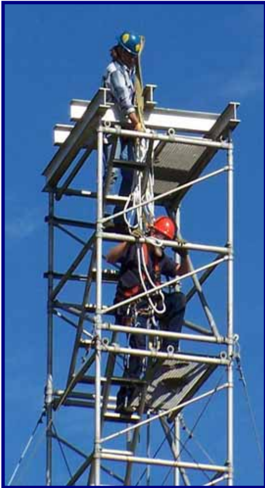
Climbing was required for servicing