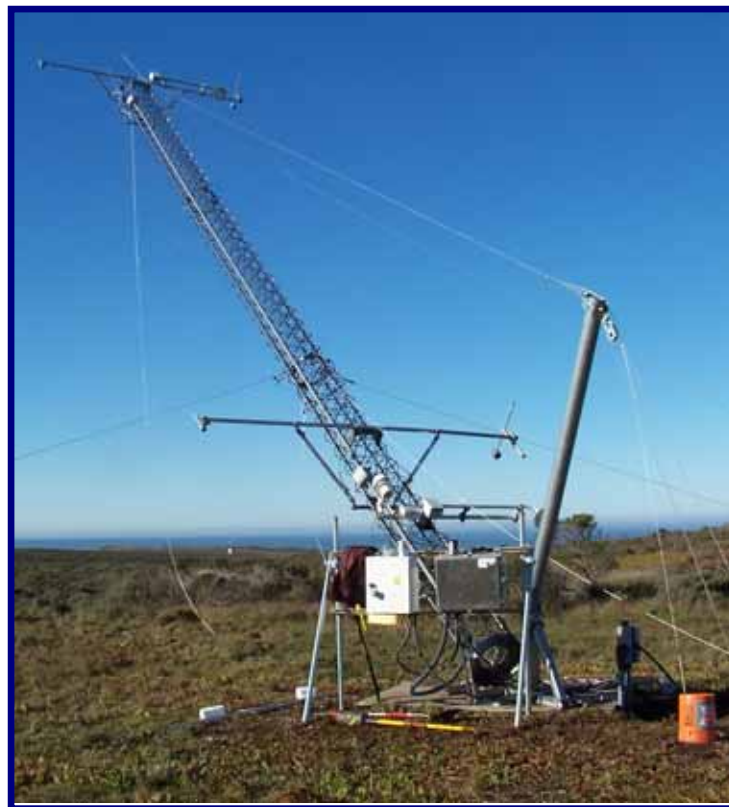
Vandenberg AFB, CA