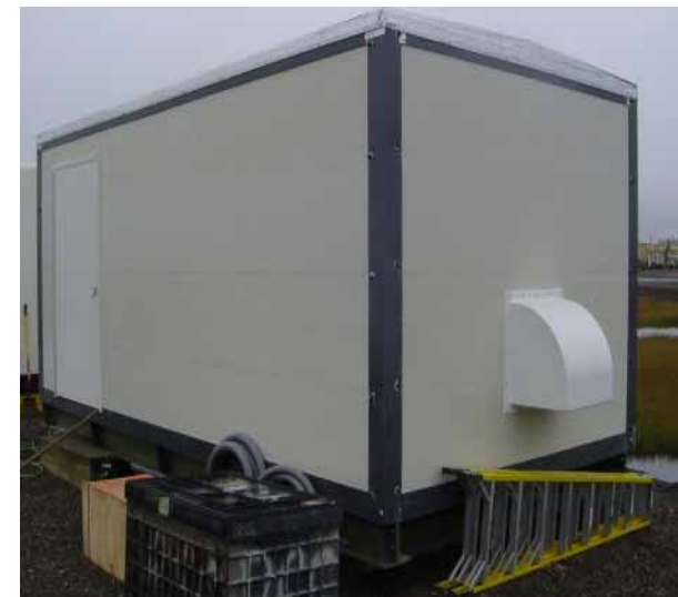
Composite shelter design for replacement of USAFE and ATCALs units.