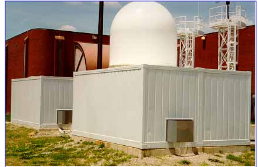
MILSTAR Radome and Shelter Depiction—Fixed Site & Transportable