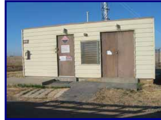
TACAN building to be replaced