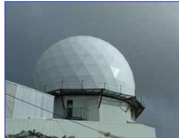
Cape Romanzof, AK